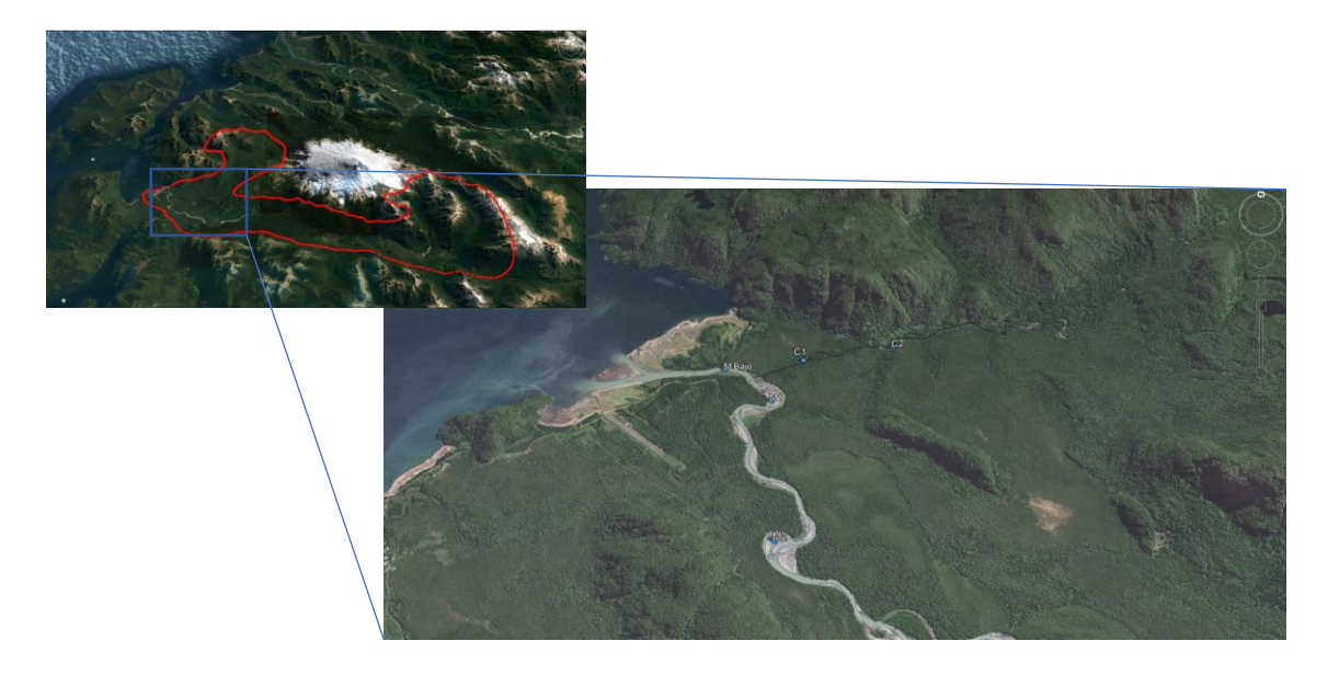
Figure 1. Study site. Red line shows the boundaries of the Marchant River Basin. Blue box shows the sampling sites in the Colonos River (Colonos 1: C1; Colonos 2: C2) and in the Marchant River (Marchant bajo: M Bajo; Marchant 1: M1; Marchant 2: M2).