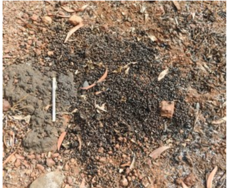
A four horned antelope dung pile photographed in the study region.

Grids sampled (with yellow point overlay) to assess relative abundance of ungulates in the Tillari region, April2016.