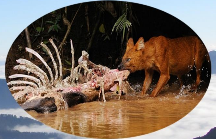
Poisoning of the carcass