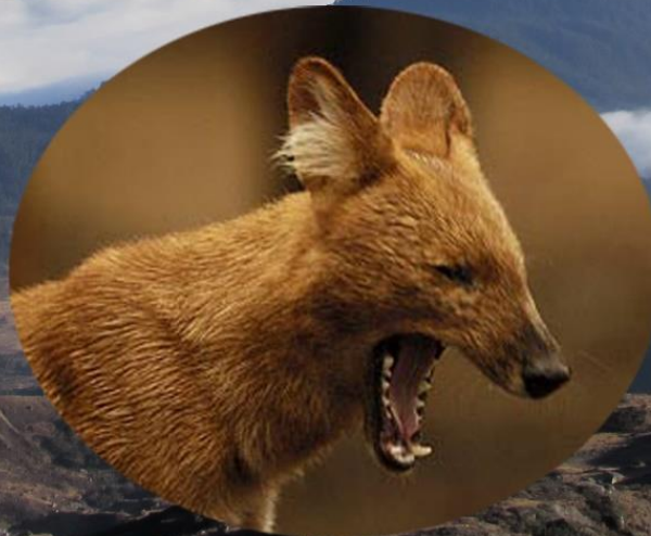
Lack of prey