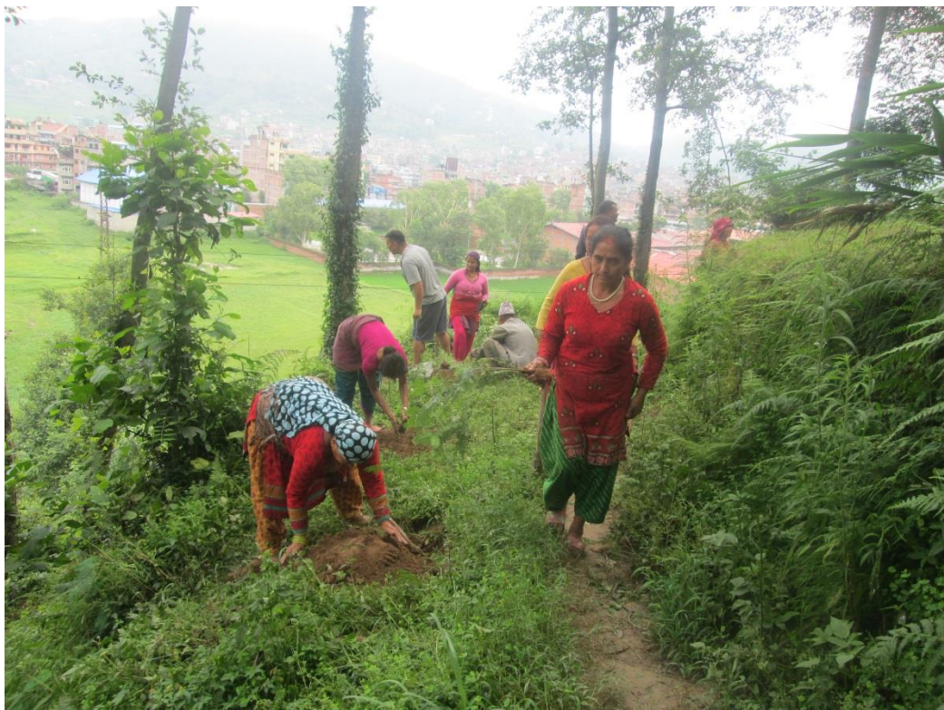
Plantation in demo plot