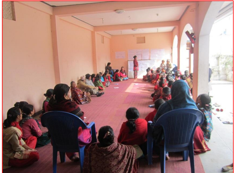
Training and meetings