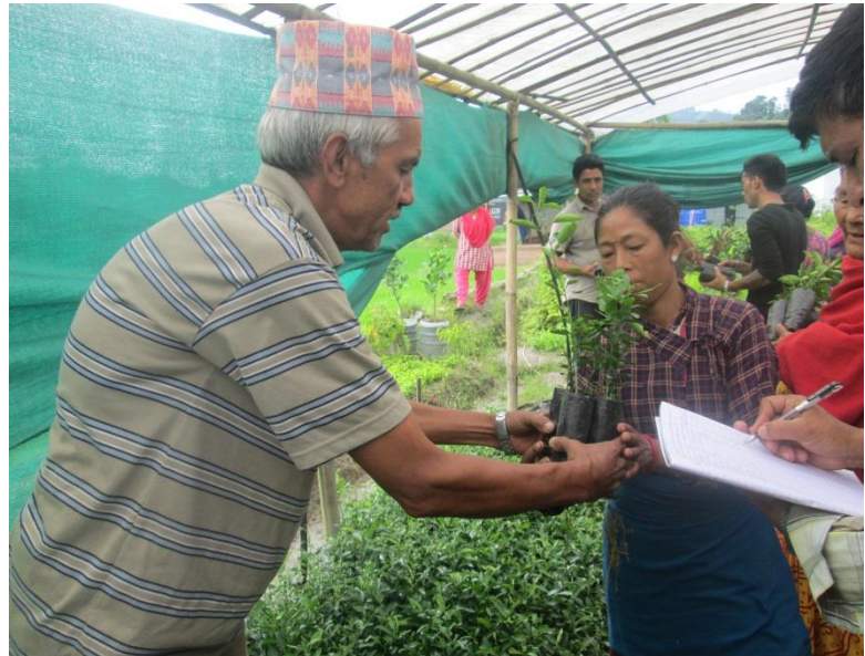
Seedlings distribution to users