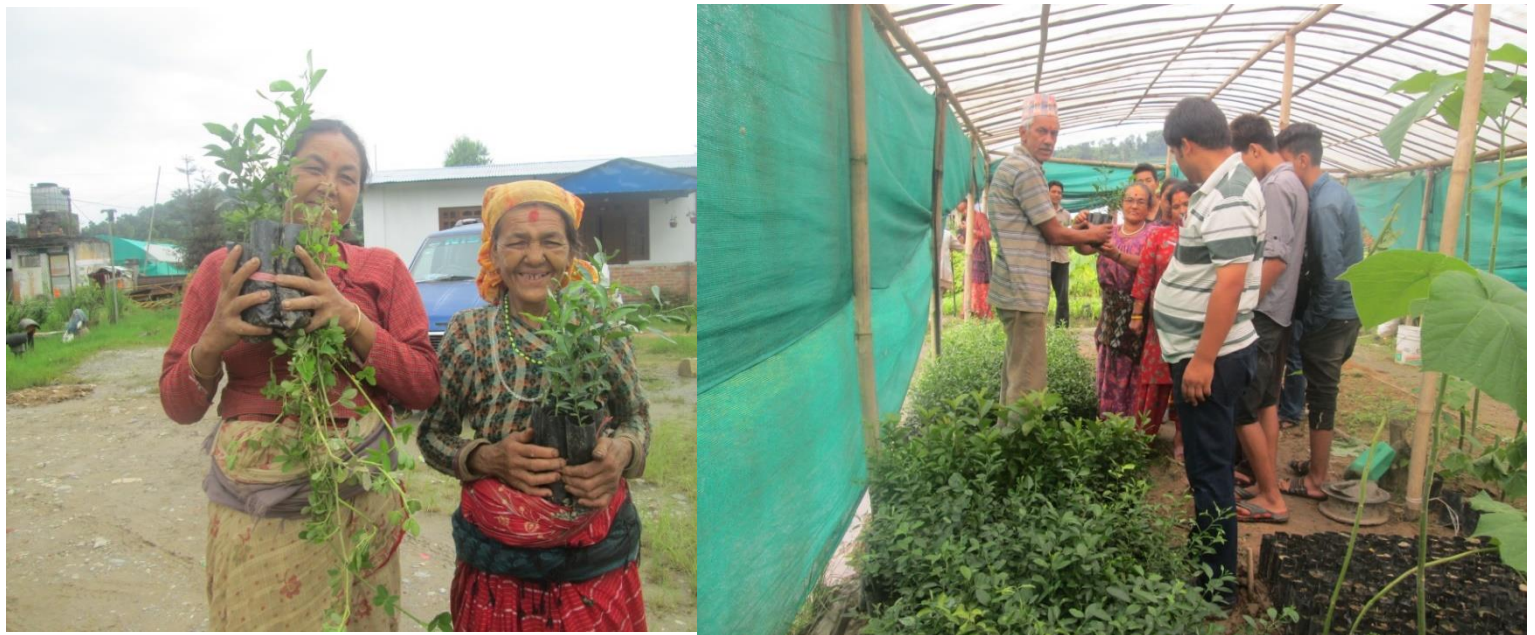
Seedling distribution to users