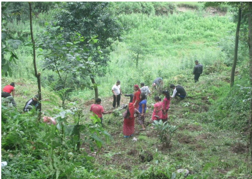
Plantation in demo plot