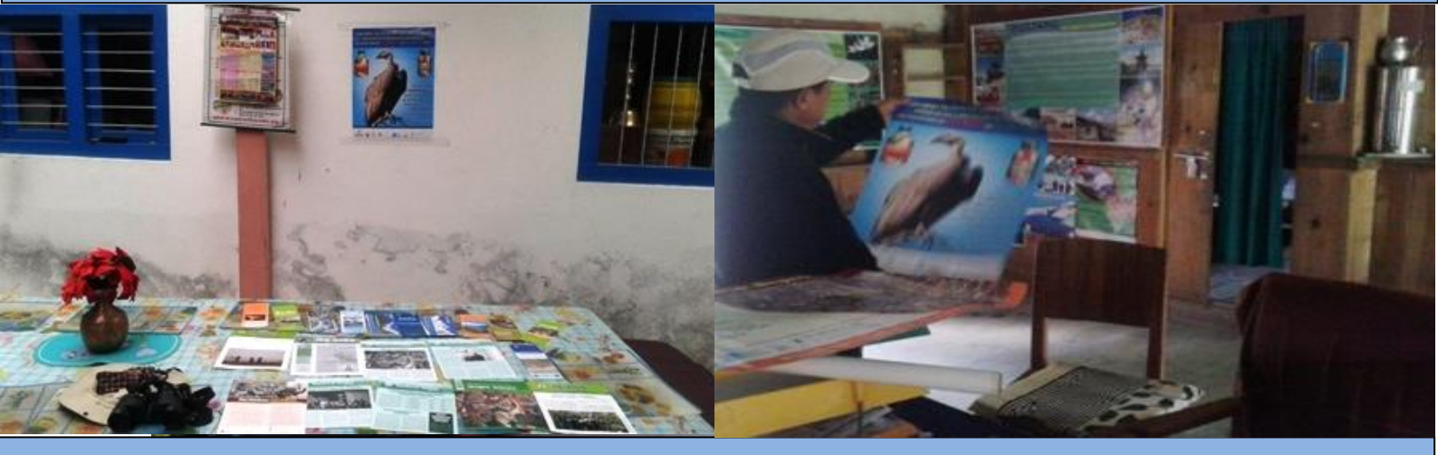
@ Hotel Dhaulagiri Ice-Fall, Larjung, Mustang