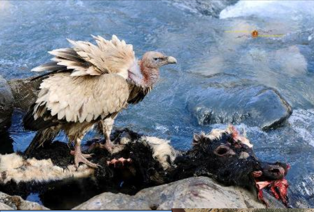
Himalayan Vulture Feeding on Yak Carcass at Manang.