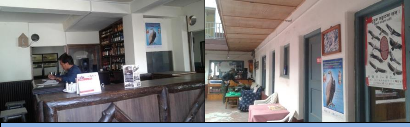
@ Hotel Grand Sambala, Ranipauwa, Mustang

@ Information Center, Muktinath, Mustang