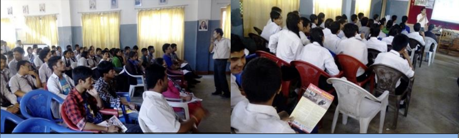
Celebrating 'International Vulture Awareness Day' on 4th September, 2016 at Basu Higher Secondary School and College

One-day school education programme on 'Save the Vulture, Save Wildlife, Save Nature for Human welfare' was organized at Janahit Higher Secondary School, Jomsom, Mustang on 30<sup>th</sup> May, 2016.