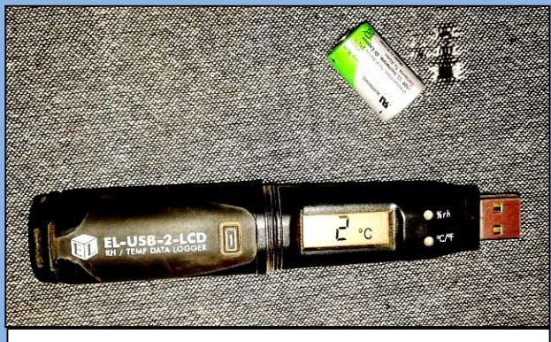
Figure 1. EL-USB-2-LCD, Climatic data logger

The maximum and average temperature of the Annapurna region have been rising since 2002 while minimum temperature has been rising since 2007. Average daily solar radiation, total dew point temperature and rainfall have been sinking down leaving the wind speed still in steady state condition