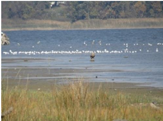
White-tailed eagle on its hunting ground