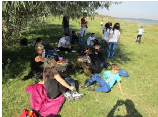
School in nature