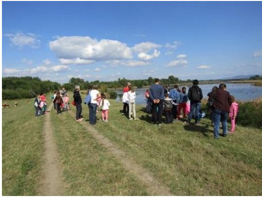
Children, school in nature