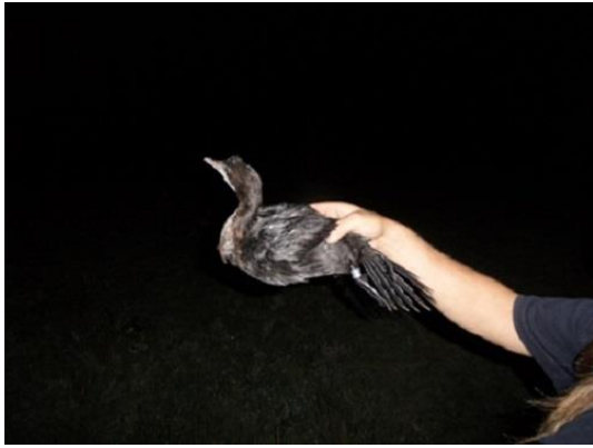
Just ringed pygmy cormorant