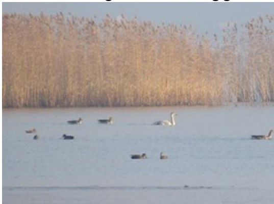
Tundra Swan, rare bird on wintering and the passage