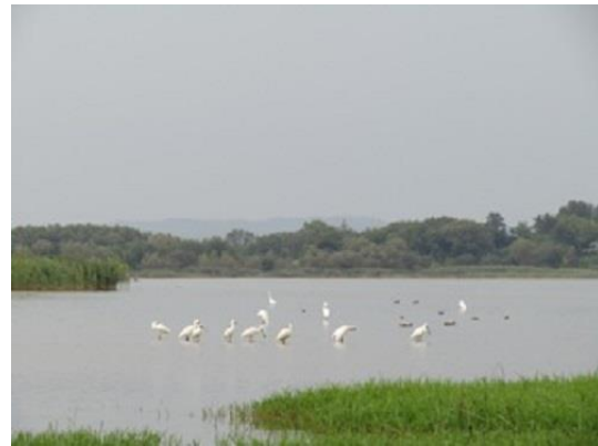
Spoonbills resting and feeding