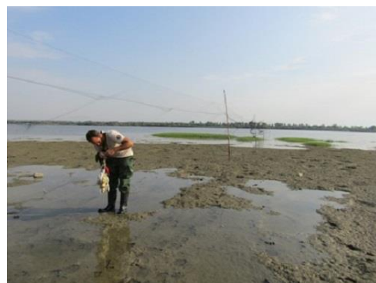
Bird ringing, extracting birds from the mist-net