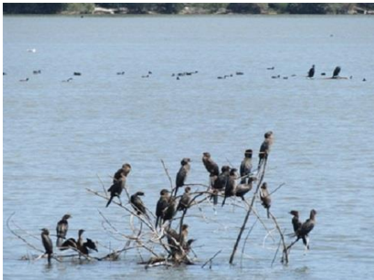
Pygmy cormorants resting - one of the flagship species for the site

Several articles, describing the project's goals, conservation contributions and main activities were written and are currently pending to be published.