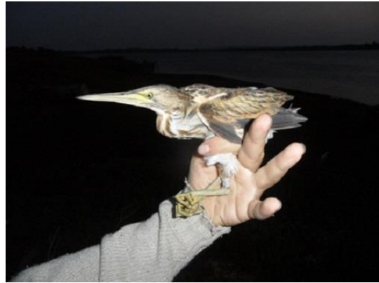
Just ringed little bittern