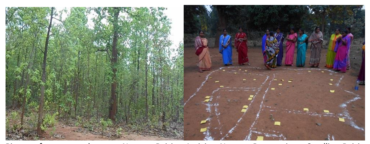
Pictures from top to bottom: Nursery Raising Activity; Nursery Preparation - Seedling Raising; Interaction on adaptation of Non-lure crop with Tribal community; Women participants during capacity building activity at Paribartan Campus; Conservation initiative of natural forest by tribal community and women's groups demarcating agricultural land during preparation of resource map.