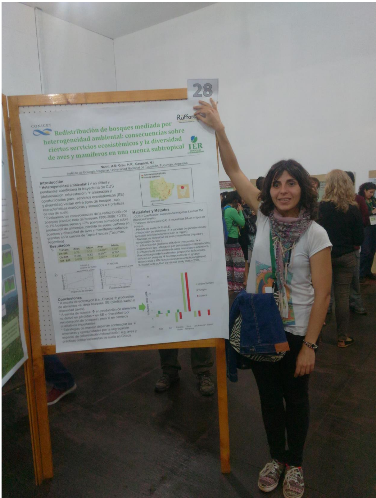
Poster in Puerto Iguazú Conference