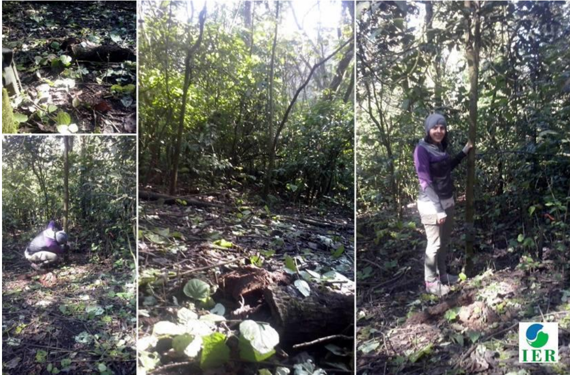
Trap-cameras collocation during field sampling in Yungas forests