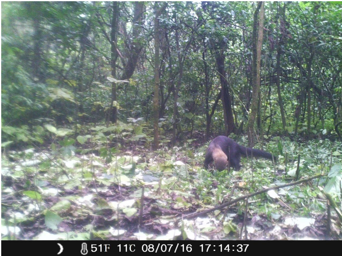
Eira Barbara in Yungas forests of the study area.