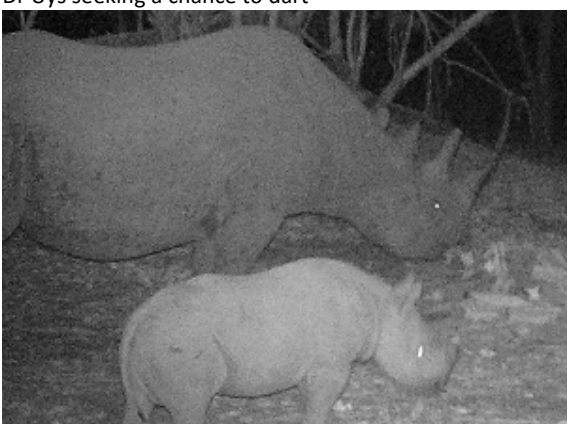
Mother & newborn