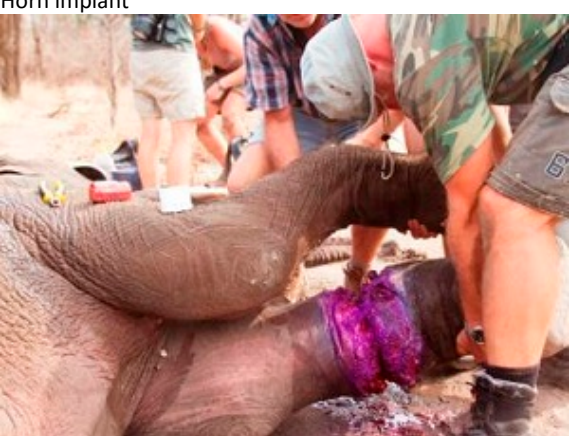
De-snaring subadult elephant