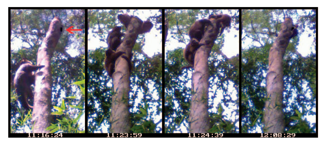
FIG. 4. Sequence of images, registered by a camera trap, of Black Capuchin Monkeys ( Sapajus nigritus ) at a nest of Lineated Woodpecker ( Dryocopus lineatus ) with three 4-day old nestlings in PP Cruce Caballero, on 27 October 2014. At 11:16:24 a monkey climbs up the nest snag. Red arrow indicates the cavity entrance. By 11:23:59, three other monkeys have joined it near the nest cavity. The left middle monkey sits on its haunches and seems to be inspecting something in its front paws, while the monkey on the right leans over into the cavity entrance. 11:24:39 the monkey on the right puts its hand into the cavity entrance. 12:08:09 adult woodpecker returns to the cavity entrance after the monkeys leave.

another monkey peeking into and reaching into the cavity (Fig. 4). The resolution of the photos is too poor to see an item the size of a 4-day old woodpecker nestling. The camera trap did not document another potential predator approach the nest during 322 (daylight) monitoring hours. Although we cannot rule out the possibility of a nocturnal predator, we consider the Black Capuchin Monkeys documented on 27 October as the most probable predators of the two nestlings.