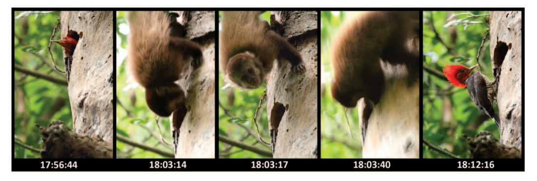
FIG. 3. Sequence of images taken from a blind, showing a Black Capuchin Monkey ( Sapajus nigritus ) attempting to depredate a nest of Helmeted Woodpecker ( Dryocopus galeatus ) in PP Cruce Caballero on 15 October 2013. At 17:56:44, the male Helmeted Woodpecker looks from the nest cavity as a group of monkeys approaches; 18:03:14 the monkey peeks into the nest cavity; 18:03:17 it looks at the camera presumably because of hearing the mirror slap; 18:03:40 it inserts a hand in the cavity, then leaves without taking an egg; 18:12:16 the male woodpecker returns to the nest.

was no longer active that afternoon or on following days.