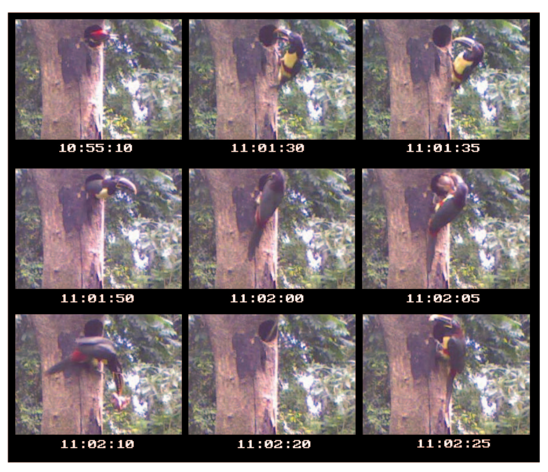
FIG. 2. Sequence of images registered by camera trap, showing a Chestnut-eared Aracari ( Pteroglossus castanotis ) depredating a nest of Lineated Woodpecker ( Dryocopus lineatus ) in a tree cavity at PP Cruce Caballero, 13 October 2014. At 10:55:10 the brooding female woodpecker looks from the cavity entrance with open bill; 11:01:30 and 11:01:35 the aracari clings to the cavity; 11:01:50 the aracari emerges from the cavity; 11:02:00 the aracari reaches in to the cavity; 11:02:05 the aracari removes the 7-day old woodpecker nestling; 11:02:10 the aracari drops the nestling, 11:02:20 the aracari climbs into the cavity (tip of tail visible); 11:02:25 the aracari holds an egg or egg shell in its bill.

times, removed the nestling and dropped it on the ground (it appeared too large for an aracari to swallow), and removed an egg or egg shell (Fig. 2). At 1115 the nestling was found dead on the ground below the cavity, with small wounds to the skin, and the cavity contained the remains of an egg (M. Cenizo, pers. comm.).