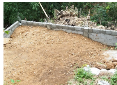
The base of the where the nursery will be put up