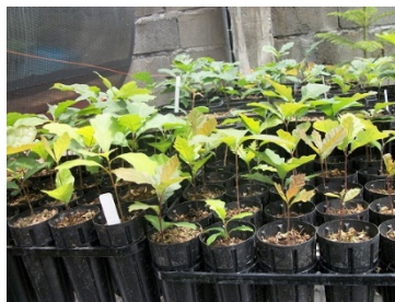
Oak ( Quercus Macrocarpa x gambelli )