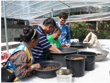
This was during the training with Idaho University USA technical experts on nursery management last January 9-12, 2016. The venue was on the constructed nursery.