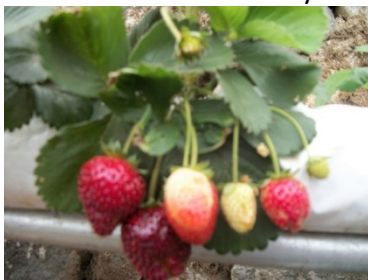
Sweet Charlie Strawberry