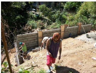
Preparation of riprap or the foundation of the nursery

We have more seeds to sow and with the arrival of the pots, we shall plant the ones that have just gone through stratification.