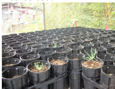
California Red Fir