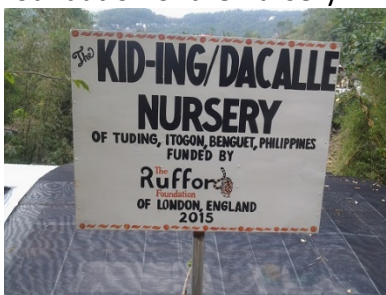
Rufford signage overlooking the nursery - the nursery measures 24 x 30 feet.