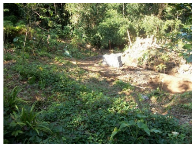
Preparation of riprap or the foundation of the nursery