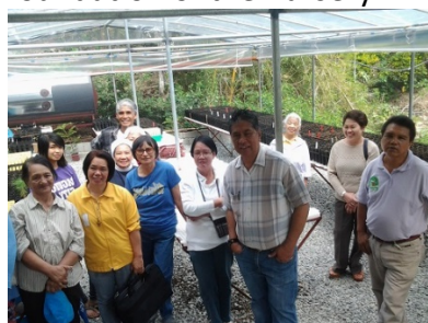
The blessing of the nursery where background shows pots planted with coffee seeds.