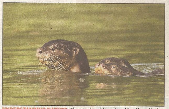
UNDERSTANDING NATURE: The study will begin with otters that inhabit the clear waters of the Moyar in Mudumalai Tiger Reserve

A scholar is now leading a team that is researching otters in the state, a subject that a scientist last focused on more