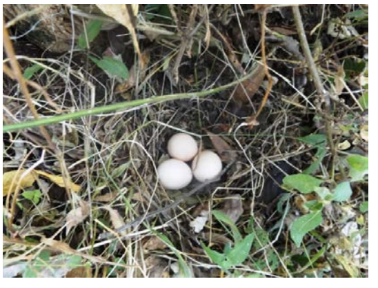
A francolin's nest (most species were in their breeding period)