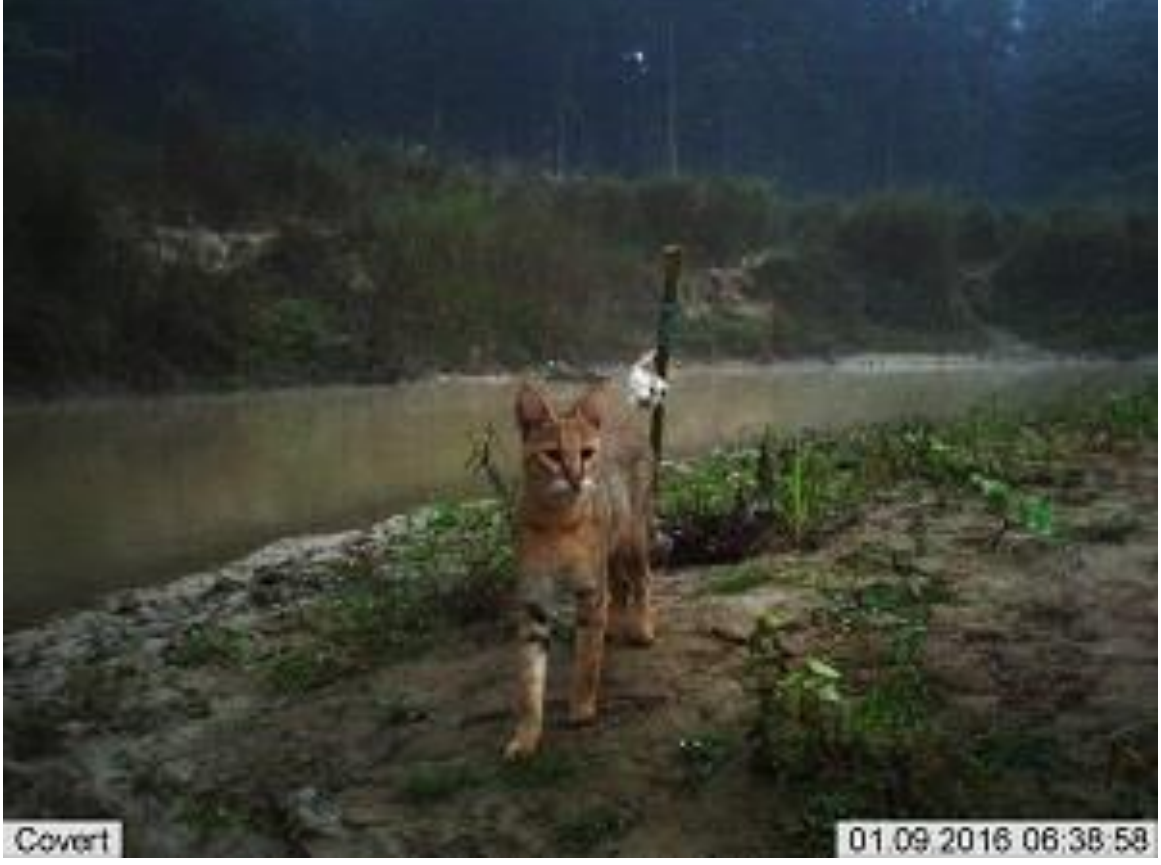
Jungle Cat recorded at the bank of Sunsari River inside Ramdhuni forest. Ramdhuni is a religious forest few 10 km east of Koshi Tappu Wildlife Reserve