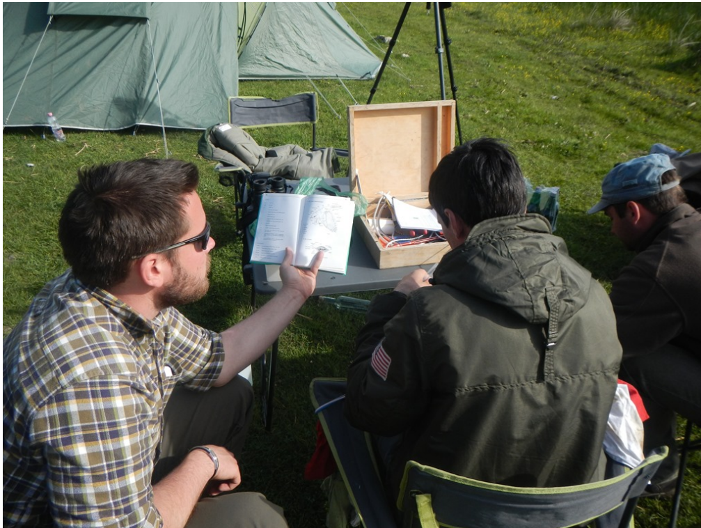
Bird banding near Prespa-lake.