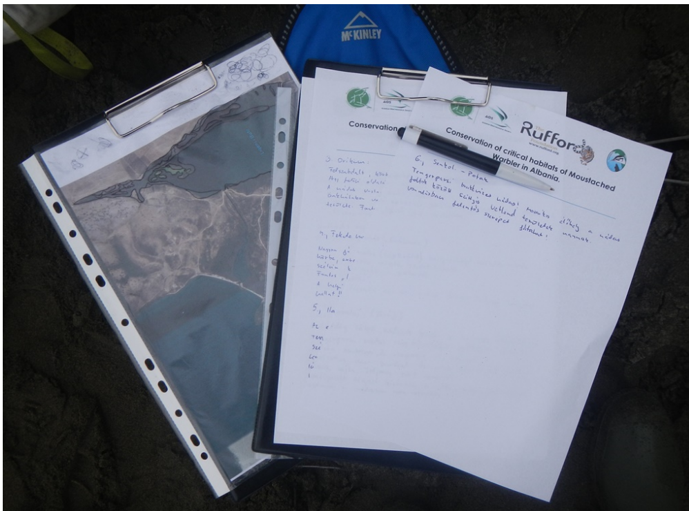
Notes about the research.