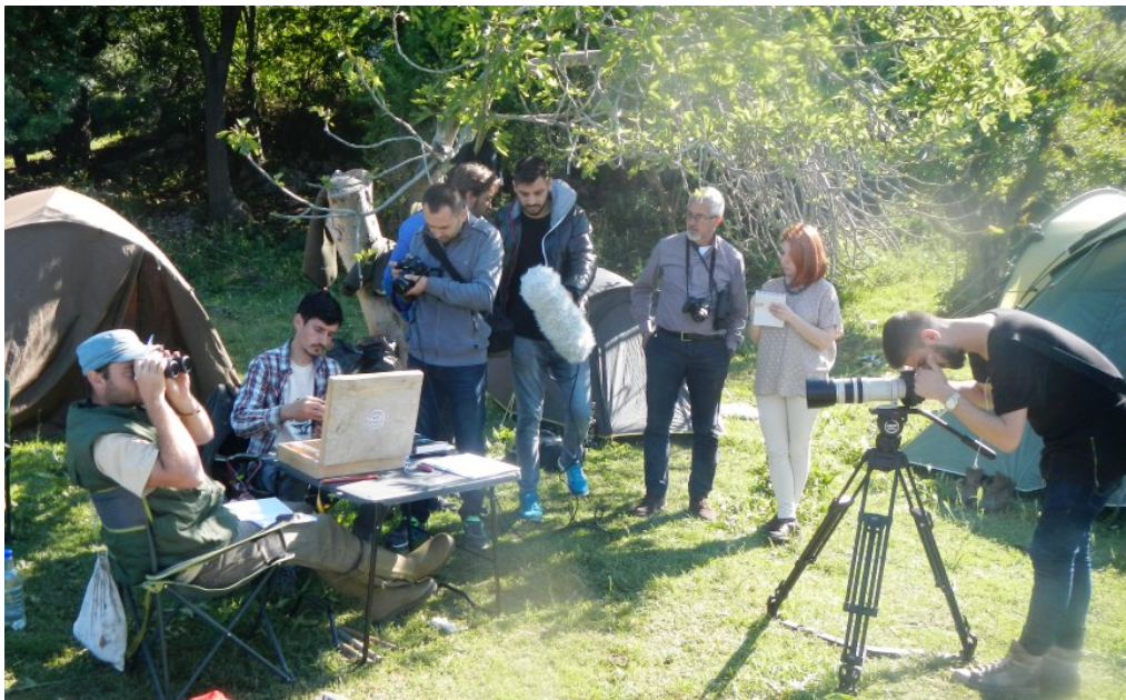
Albanian tv channel is shooting the documentary near the Buna-river.