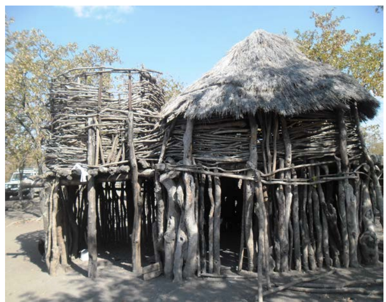
Figure 4: Some structures at a homestead in Malipati built with wood sourced from outside and within the National Park.