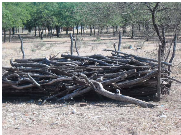
Figure 5: A heap of firewood stored at a homestead in Malipati Communal Area.