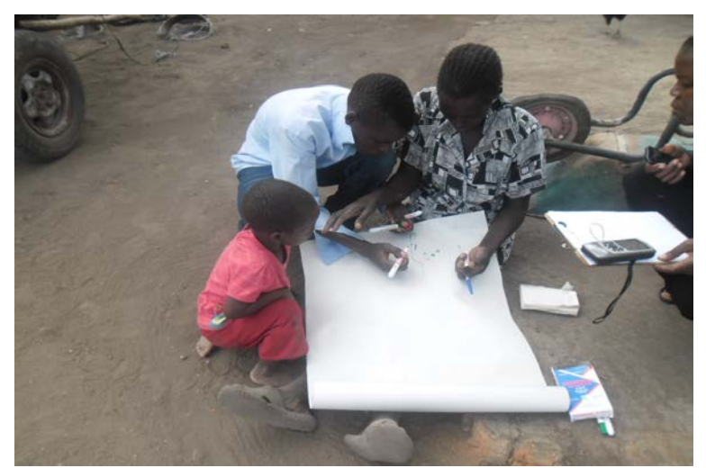
Figure 2: A mother and her children drawing a map of their village highlighting areas of the forest where they access wood for firewood and building.

Ecological vegetation surveys were also carried out. These were meant to establish the current state of the woodlands were people access tree resources and also compare with the state of vegetation in the park. Plotless sampling methods in the form of transects were used. The number of transects was determined by an adapted species-area curve. Data entry is still in progress and analysis will commence soon after.