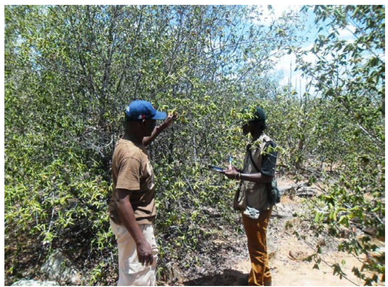
Figure 3: Measuring vegetation in a stand of Androstachys johnsonni , a woody species popular with locals for construction poles.

Ecological vegetation surveys were also carried out. These were meant to establish the current state of the woodlands were people access tree resources and also compare with the state of vegetation in the park. Plotless sampling methods in the form of transects were used. The number of transects was determined by an adapted species-area curve. Data entry is still in progress and analysis will commence soon after.