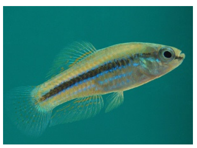
Cubanichthys cubensis a vulnerable endemic fish from Cienaga de Zapata National Park.