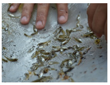
with the seine.