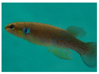
Rivulus cylindraceus a vulnerable endemic fish from Cienaga de Zapata National Park.