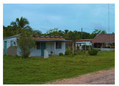
A view from Los Hondones, a local community where ongoing activities regarding to the project are implementing.