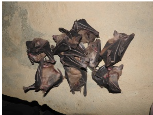
Hunted bats by the locals