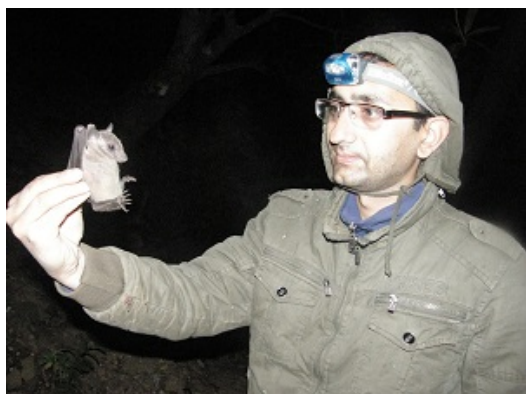
PI holding captured bat before In Situ release