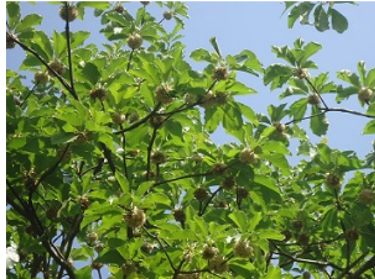
A branch of Dipklonema butyraceae with inflorescence