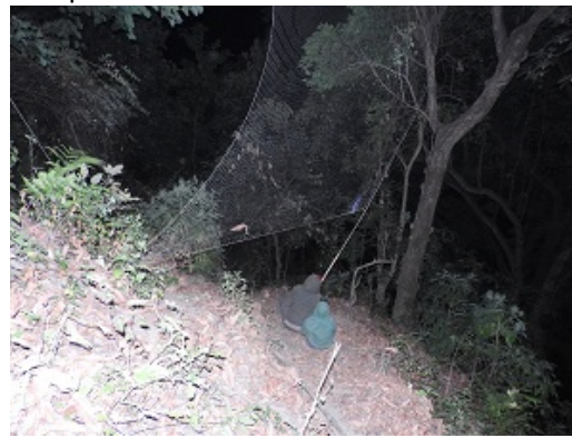
Locally made net to hunt bats spread under flowering D.butyraceae tree