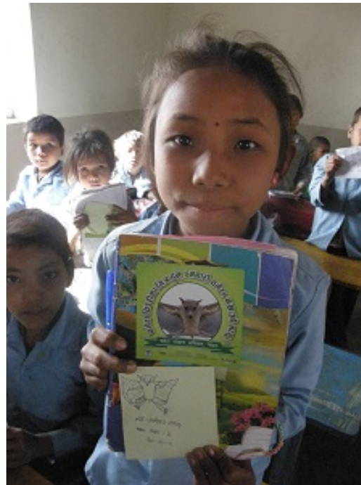
A student showing her drawing made for competition