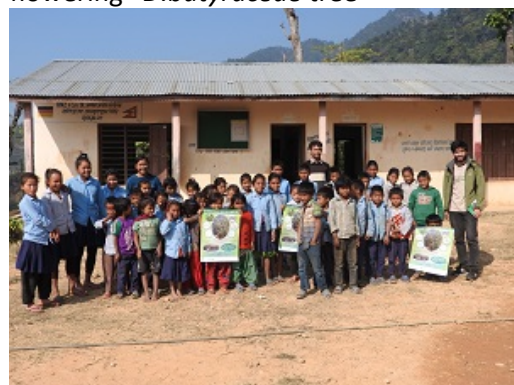
Research Assistant with students after outreach interaction for bat conservation