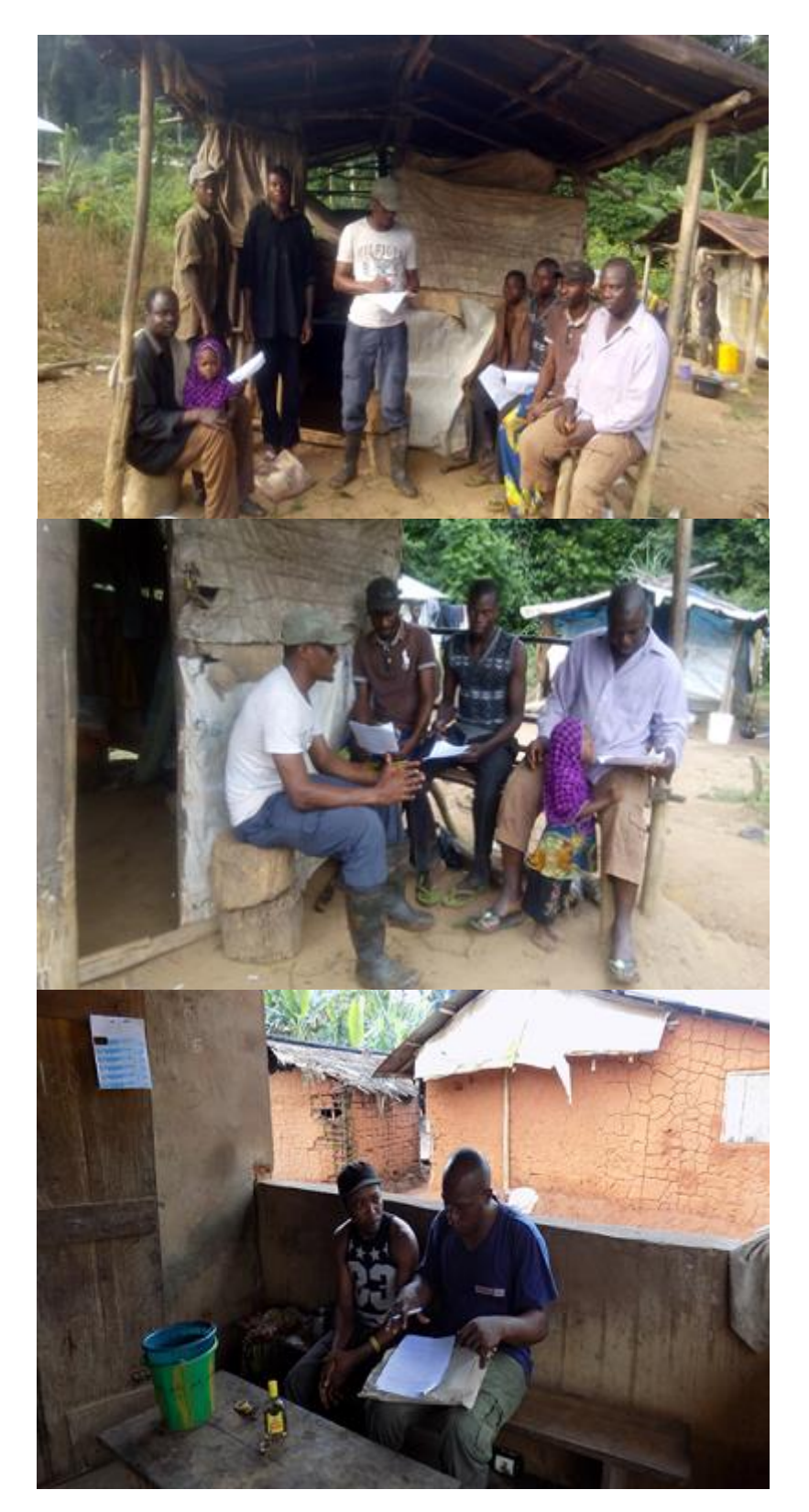
Questionnaire administration for gathering socio-economic data