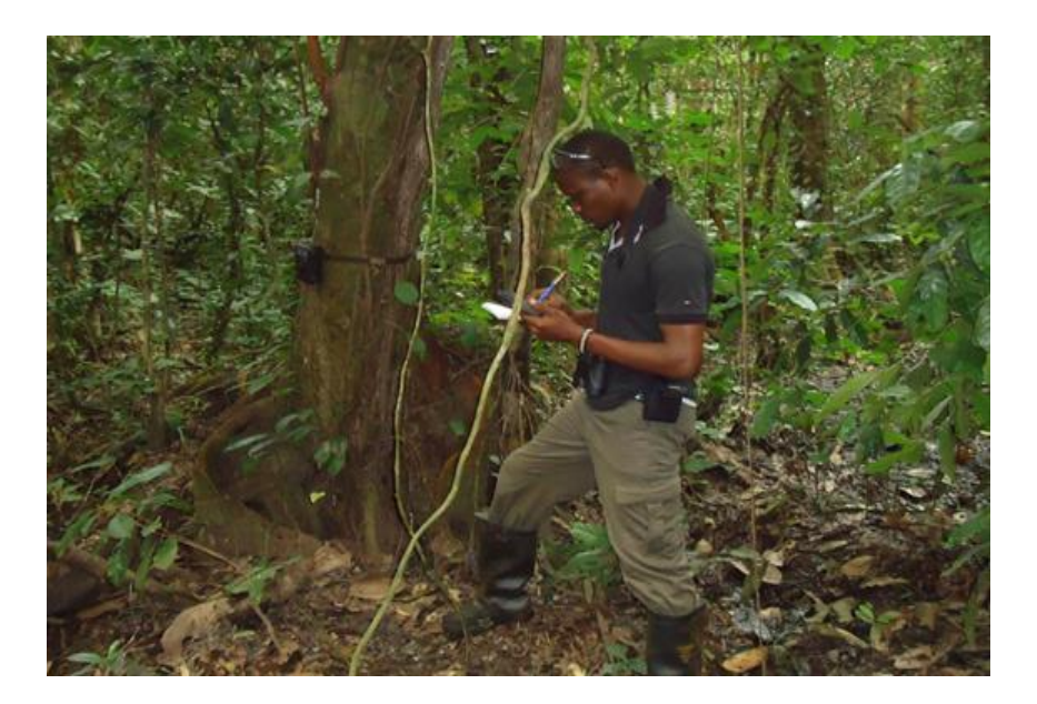
Elephant habitat-related factors including land use information and threats at survey