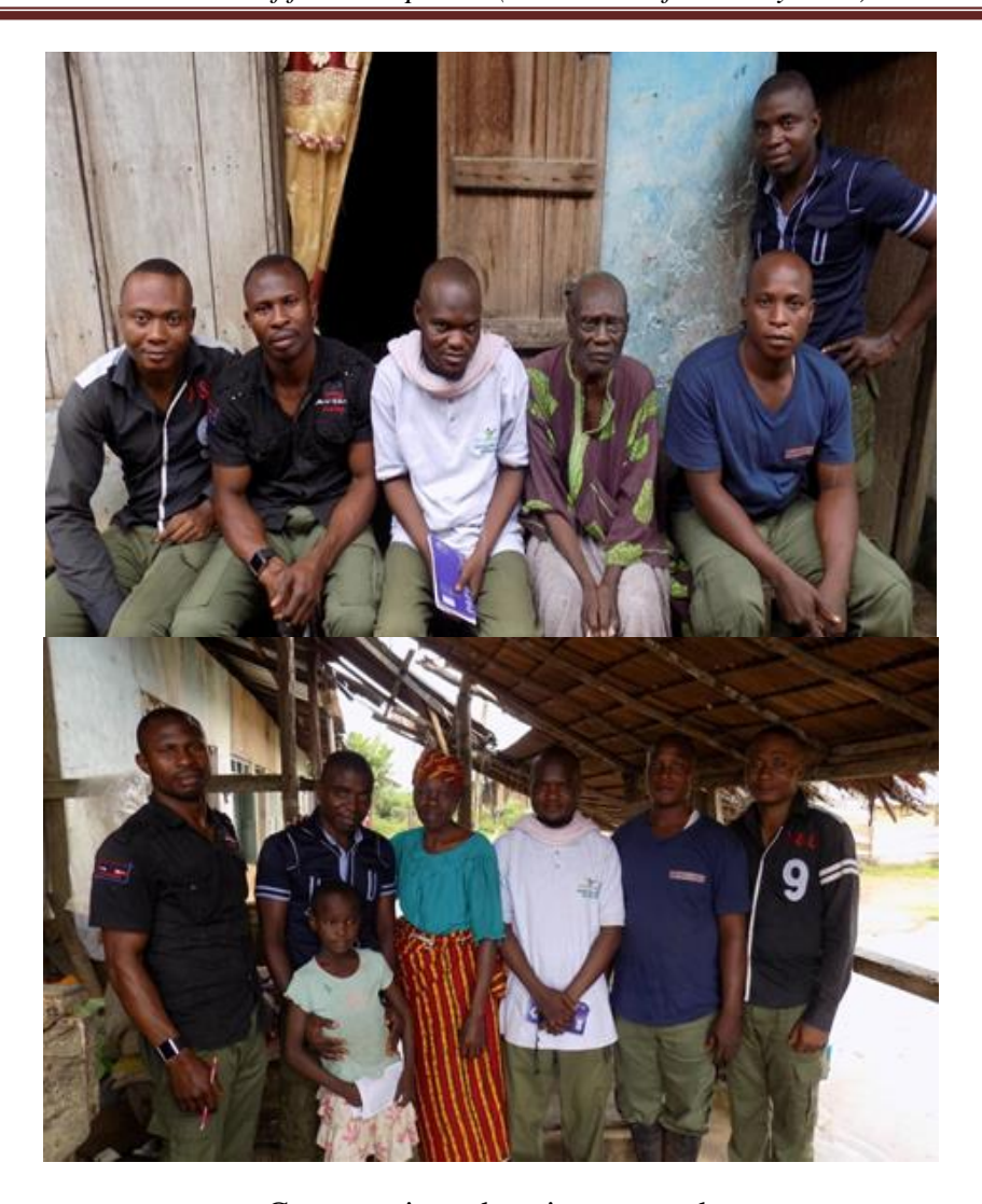
Conservation education outreach