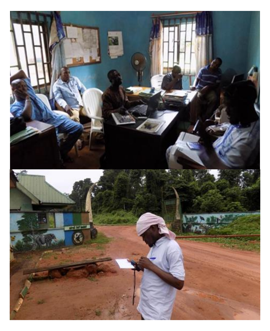
Sensitization and planning meetings with community stakeholders

Project planning and discussion of protocols