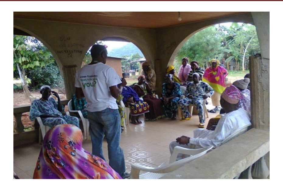
Questionnaire administration for gathering socio-economic data