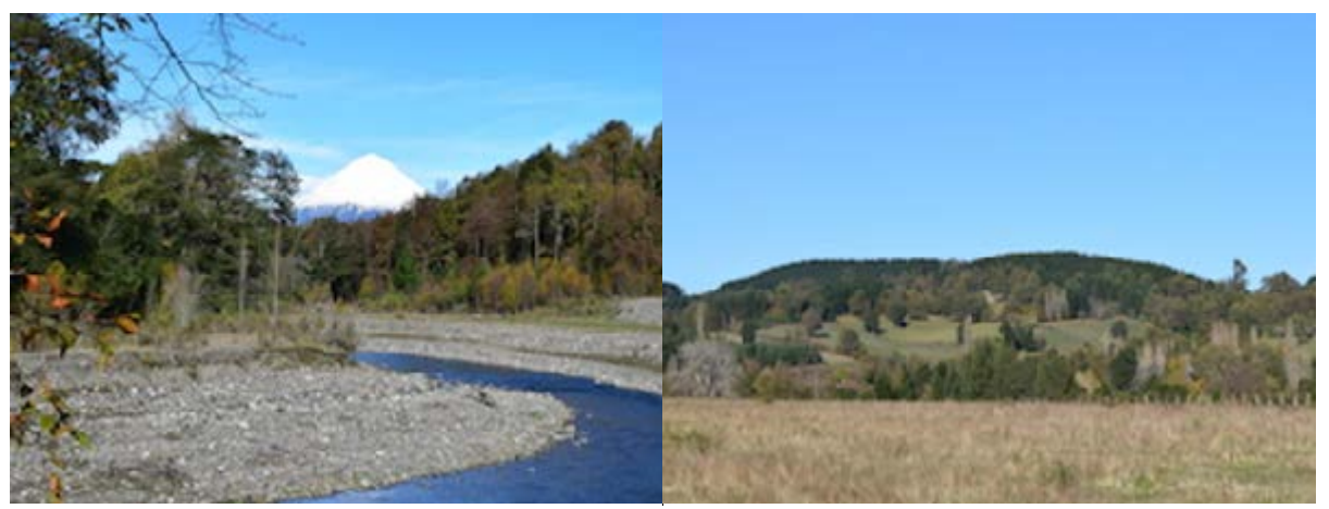
Left: Llaima Volcano and Blanco River, powerful spirits in the Mapuche worldview. Right: Timber plantations on ancestral Mapuche Territory, Curacautin, Chile

During my fieldwork I was able to visit several Mapuche Communities in the Region of La Araucania. I was lucky to be able to collaborate with the Alianza Territorial Mapuche – Mapuche Territorial Alliance and the Indigenous Studies Institute (University of La Frontera). Being able to visit different Mapuche communities allowed me to have a greater sense of the big picture. Although these communities are part of the same Mapuche Nation, they have some differences depending on their geographical location. Thus, people who lives on the coast have different practices than those who live in the mountains. In this differences is where I found one of the limitations Mapuche people are struggling with in their process of adapting to climate change. Under the government's programme of land restitution, many communities are acquiring land in different geographical areas, and therefore being relocated outside their traditional territories, under different climatic conditions"