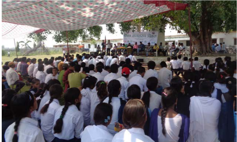
measures. More than 300 Figure 3. Participants in the World Environment Day-2015.

measures. More than 300 local students, teachers,