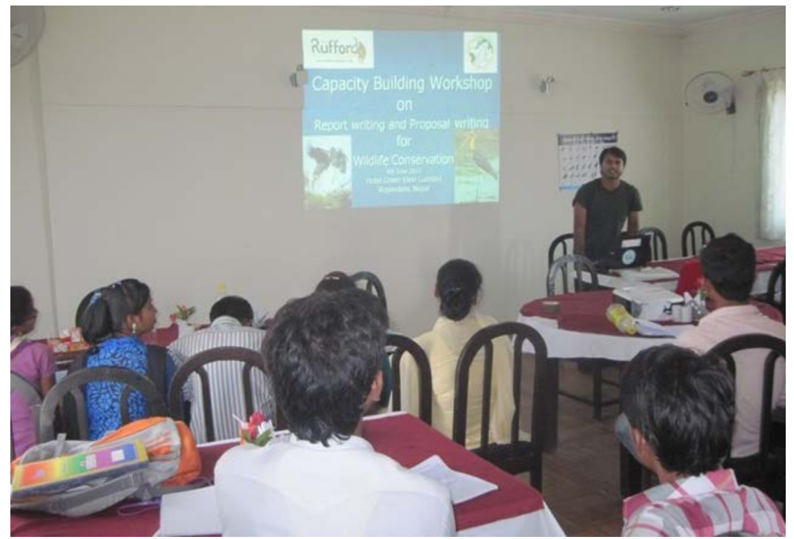
Figure 5. Participants giving attention on Workshop.

We successfully completed a one- day 'Capacity Building Training and Workshop on Report Writing and Proposal Writing' on 8th June 2015 at Hotel Green View, Lumbini. To empower the local youth and women in conservation this event was organised. Twenty youth from 'Green Youth of Lumbini' enhanced their skill from the event. During workshop the participants practically made expert in report and proposal writings for fund raising in further conservation works and continuation of their good jobs.