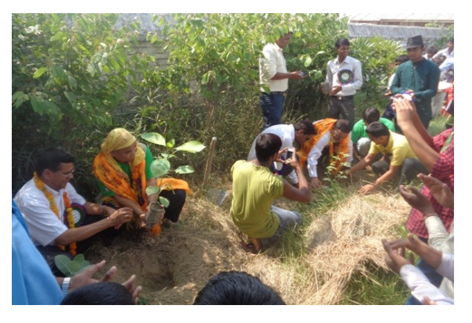
Figure 4. Plantation of Ashoka and Kadam plants.

On the occasion of WED, the plantation programme was also completed. The chief guest, main guest and other guest planted the Ashoka and Kadam plants on the barren land of the Lumbini. The Kadam is the nesting tree of lesser adjutant stork. One week plantation programme was also successfully done