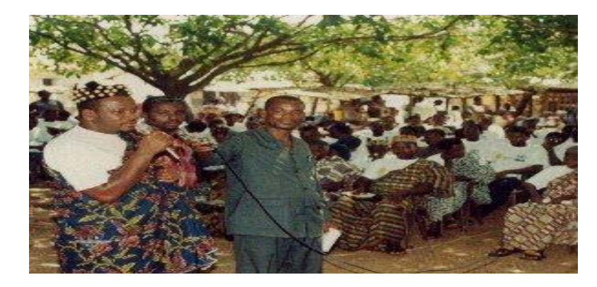
Public meeting of senziting and sharing the results of the studies with local communities in Agouégan (mangrove village in the south of Togo)

Several meetings have been organised in the project zone to share the result of the study with the communities. In the total, 10 meetings have been organiser (1 per village). A national meeting have also been organised in Lomé (capital of Togo) with technical Department of States, the University of Lomé, NGOs and journalists. Information on the summary of the results of the study was provided to all participants and electronic copies of studies were also dent to participants on request. Three live radio programs were organised in French Lomé and in a community radio in Aného (5 km from the project zone) in the local tongue (Mina). More than 3000 persons are well informed on the socio-economic importance of mangrove ecosystems and the necessity to promote their sustainable conservation.