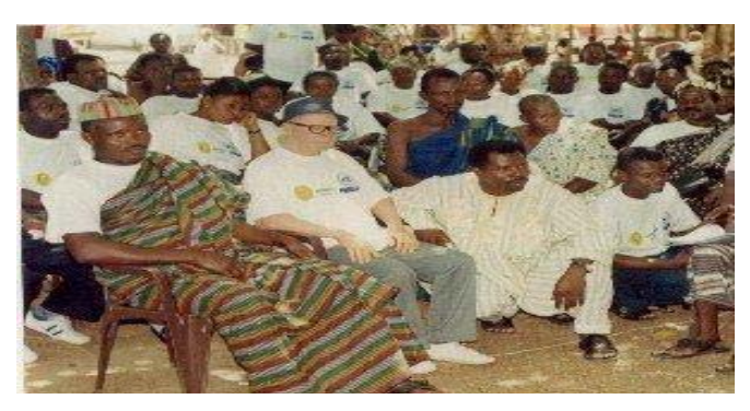
Participants during the meeting held in Agouégan on October 9, 2006

ANCE-Togo had organised 10 local workshops to reinforce the technical capacities of local communities on mangrove regeneration and the wood exploitation. Those activities were carried from October 09 to October 21, 2006. The main goal of these activities is to sensitize, educate and train local communities on the importance of mangroves and the methods of access and exploitation of natural resources. In each of the 10 villages, a local public meeting was organised as well as 1 closed workshop for 50 participants for local community radios, CBOs, farmers associations and selected individuals living with mangrove resources and campaign to local schools. A committee of 10 members was set up in each village for follow up of the recommendations of the workshop.