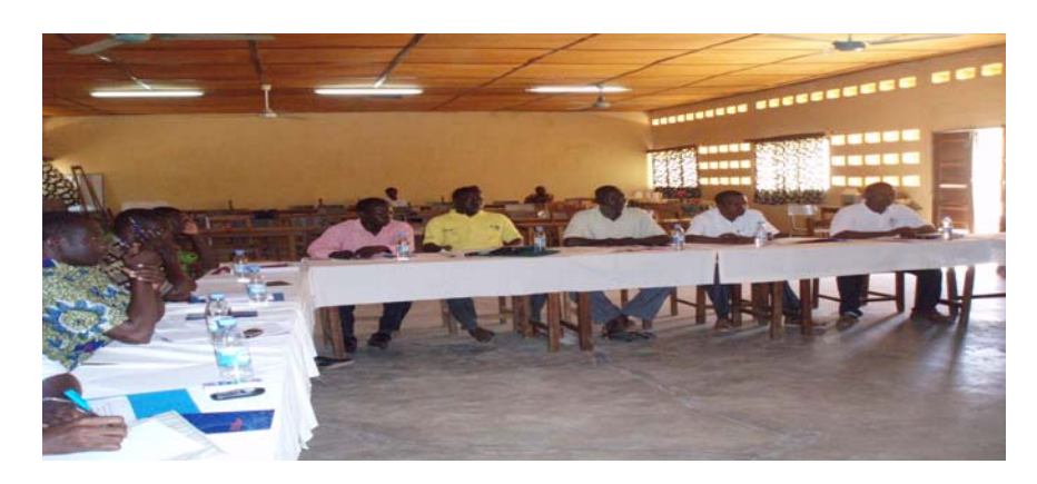
Training of the project team in the cultural centre of Aného, project zone from 5 to 6 October 2006

The project team has been then invited for a two days workshop in Lomé. This workshop aims to reinforce the technical capabilities of the project team on the various aspects of the project to distribute and to plan actions between the members of the team according to their competences. After these two days training, the participants acquired sufficient knowledge on the socio-economic importance of mangroves, mangroves regeneration, the concepts of promotion of income generating activities, etc. They also obtained information on the objectives of the project, the expected results, planned activities and the budget. Several discussions on strategies and methodology for the project success took place.