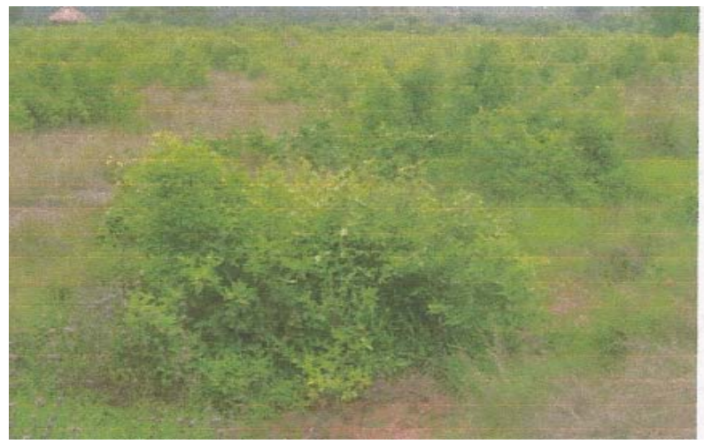
One hectare of regenerated mangrove forest in Agouégan, Photo ANCE-Togo, July 2007

Moreover, ANCE had planted in Agouégan one hectare of mangroves by the same Farmer Field School method which also made it possible to train approximately 1000 peasants on techniques of regeneration of mangroves. The local communities were very proud to be associated to these training meetings and wished that ANCE initiate each three months such training sessions.