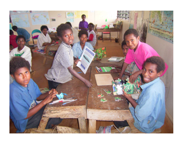
Students from Fatima Primary School

Students from 4 community schools were given a pre and post test to help TCA measure and understand the impact of this education program. The test consisted of a series of true and false questions that were read out to the students in both English and Pigeon English. This was considered to be important to eliminate any literacy problems during the test. The results showed that the majority of students improved their knowledge as a result of the education program (Figure 1). Note these results also include teachers that attended the teacher-training workshop that will be discussed later.