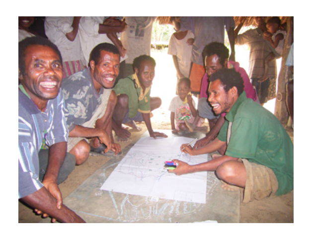
Conducting conservation area awareness at Wanulu village

If the Torricelli Mountains becomes a protected area known as a Conservation Area, it will be the first for Sandaun Province and the first Conservation Area for PNG.