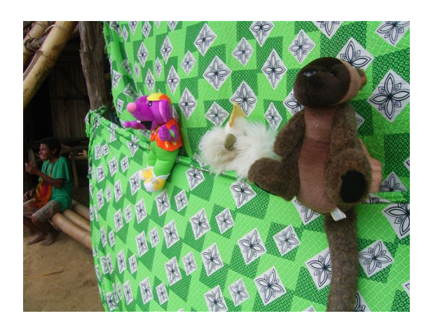
Puppet show at Yomoum village

At the same time each village received a wind-up/short wave radio. These radios were designed to give each village a sustainable source of radio (wind up power) so they could always tune in to the TCA radio program. All villages were very grateful to receive their radios.