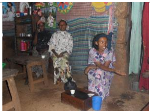
Interview with household during coffee ceremony