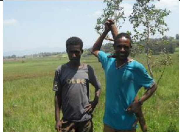
Interview with the farmers (by Dessalegn Obsi Gameda)

Some people shared their experiences during focused group discussion on the ecology of the Black Crowned Crane (Habitat preferences, feeding and breeding sites) including the population variation of the species during the dry and wet season and over series of time. The coffee ceremony, the most respected meeting in the community in which all the neighbors (15 to 20 people) call each other to drink coffee together for 30 to 45 minutes sometimes for an hour used systematically for focused group discussion. During and after coffee ceremony group discussions was conducted among the participants. First the elders share their experiences concerning the population of Black Crowned cranes whether increasing or decreasing, distribution, habitat preferences, breeding sites and time as well as their interactions with human beings particularly on their agricultural fields in rare cases. After the elders, the middle age people also share their experiences and lastly, the young people from the coffee ceremony reflect their experiences. Majority of the participants during the coffee ceremony is women.