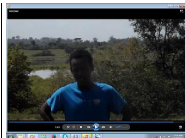
Interview with high school student