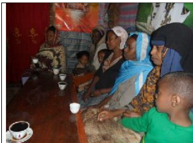
Group discussions during coffee ceremony

Some people shared their experiences during focused group discussion on the ecology of the Black Crowned Crane (Habitat preferences, feeding and breeding sites) including the population variation of the species during the dry and wet season and over series of time. The coffee ceremony, the most respected meeting in the community in which all the neighbors (15 to 20 people) call each other to drink coffee together for 30 to 45 minutes sometimes for an hour used systematically for focused group discussion. During and after coffee ceremony group discussions was conducted among the participants. First the elders share their experiences concerning the population of Black Crowned cranes whether increasing or decreasing, distribution, habitat preferences, breeding sites and time as well as their interactions with human beings particularly on their agricultural fields in rare cases. After the elders, the middle age people also share their experiences and lastly, the young people from the coffee ceremony reflect their experiences. Majority of the participants during the coffee ceremony is women.