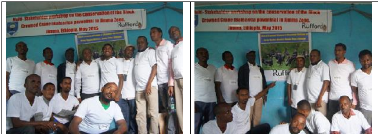
Multi stakeholder's workshop at Bege town

Open public awareness was conducted on market day in Meca dire village which is very near to Chalalaka lake on October 15, 2015. The outreach activities targeted to promote the conservation of Black Crowned Cranes for mass population within a short time which will be excellent to the community from every corner of the district since they come from different village to buy something for their family. After they return to their home they disseminate what they heard to their neighbors about the issue of conservations.