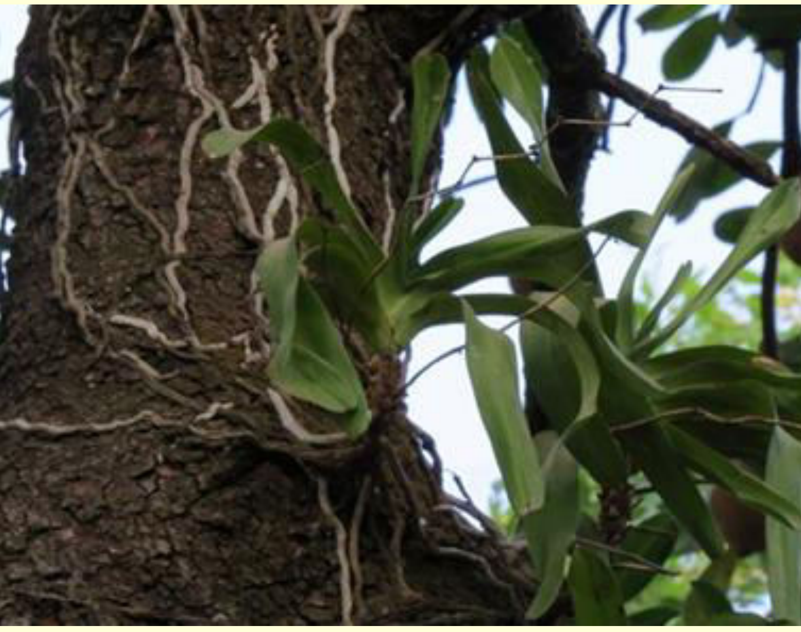
Plectrelminthus caudatus (Lindl.) Summerh.

Up to now, 10 terrestrial and 3 epiphytic orchid were recorded in the BRP. Local people has few knowledges on orchids and this varies with ethnic groups