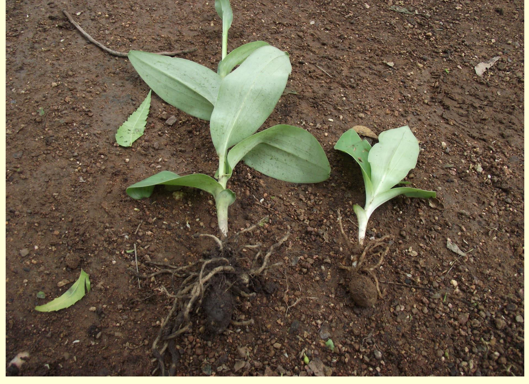
Habenaria cirrhata (Lindl.) Rchb. f.