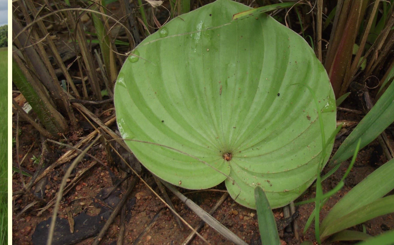
Nervilia kotschyi (Rchb.f.) Schltr.