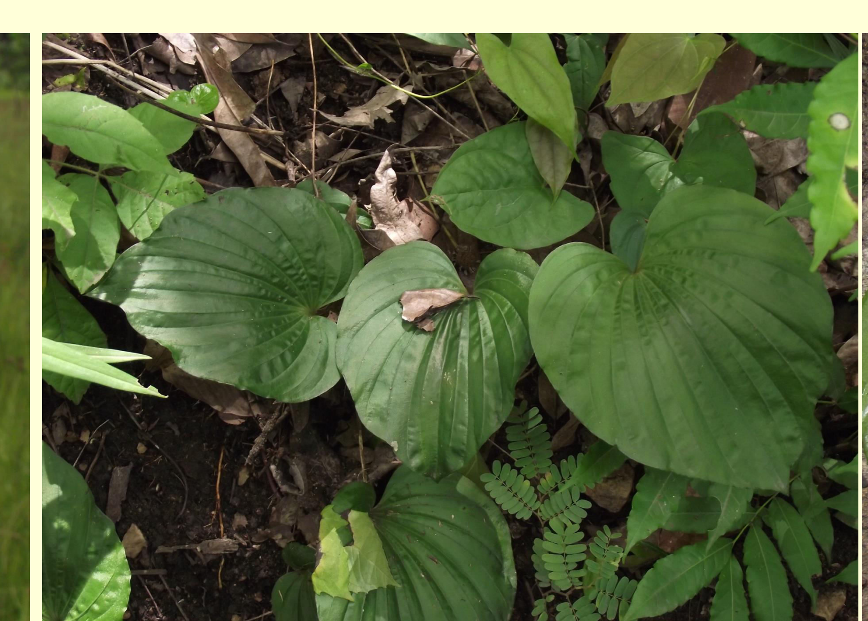
Nervilia bicarinata (Blume) Schltr.