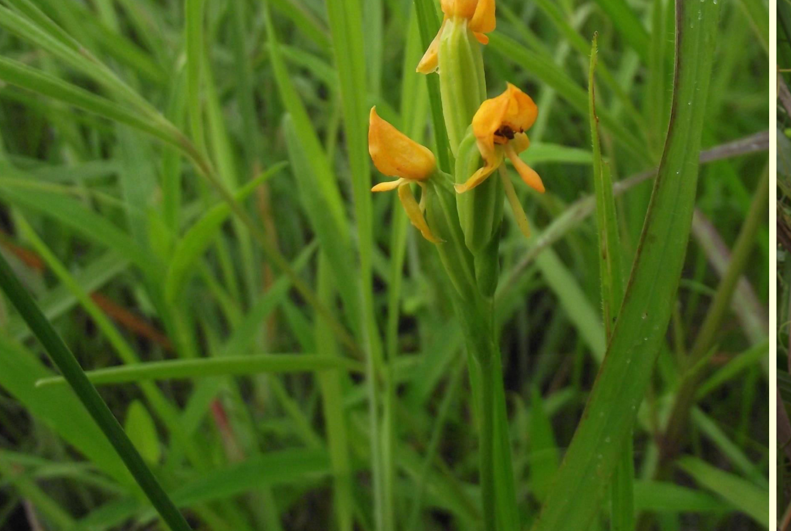
Platycoryne paludosa (Lindl.) Rolfe