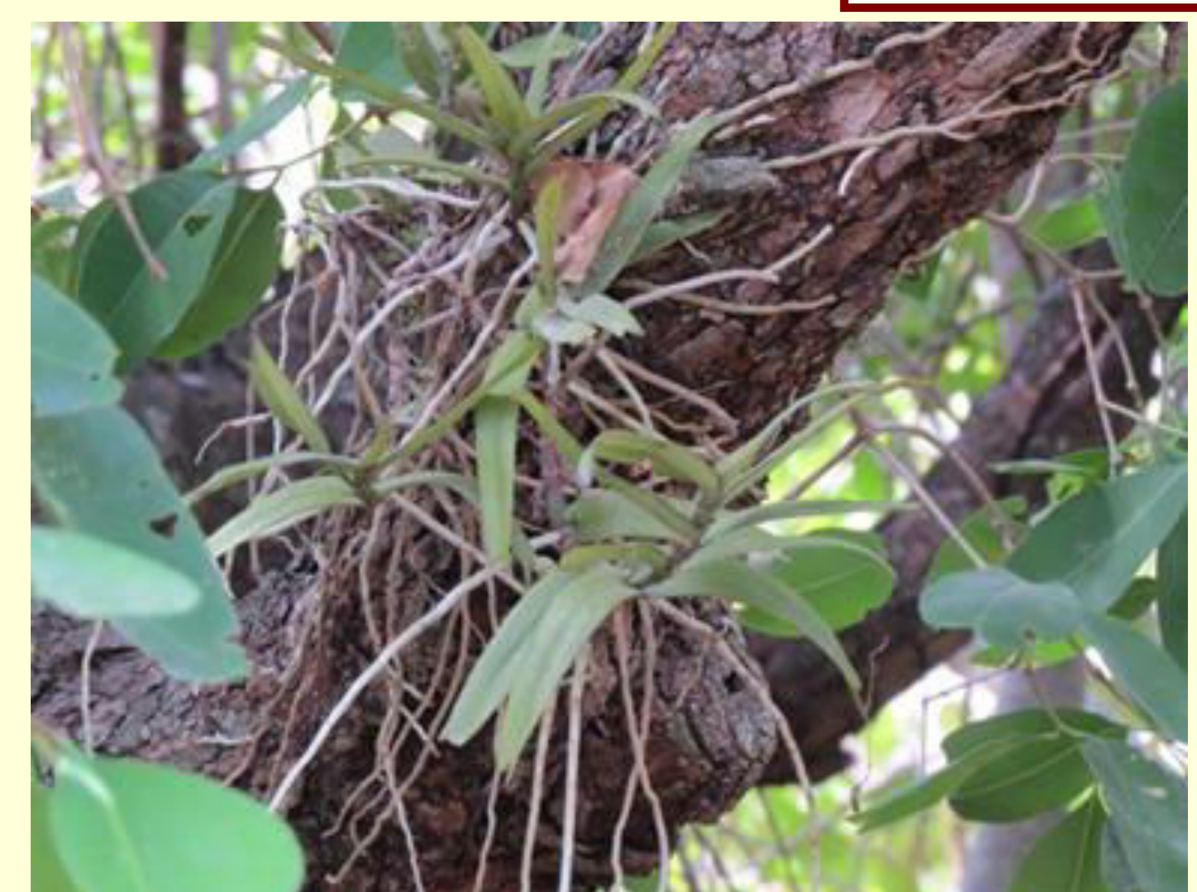
Calyptrochilum christyanum (Rchb.f.) Summerh.