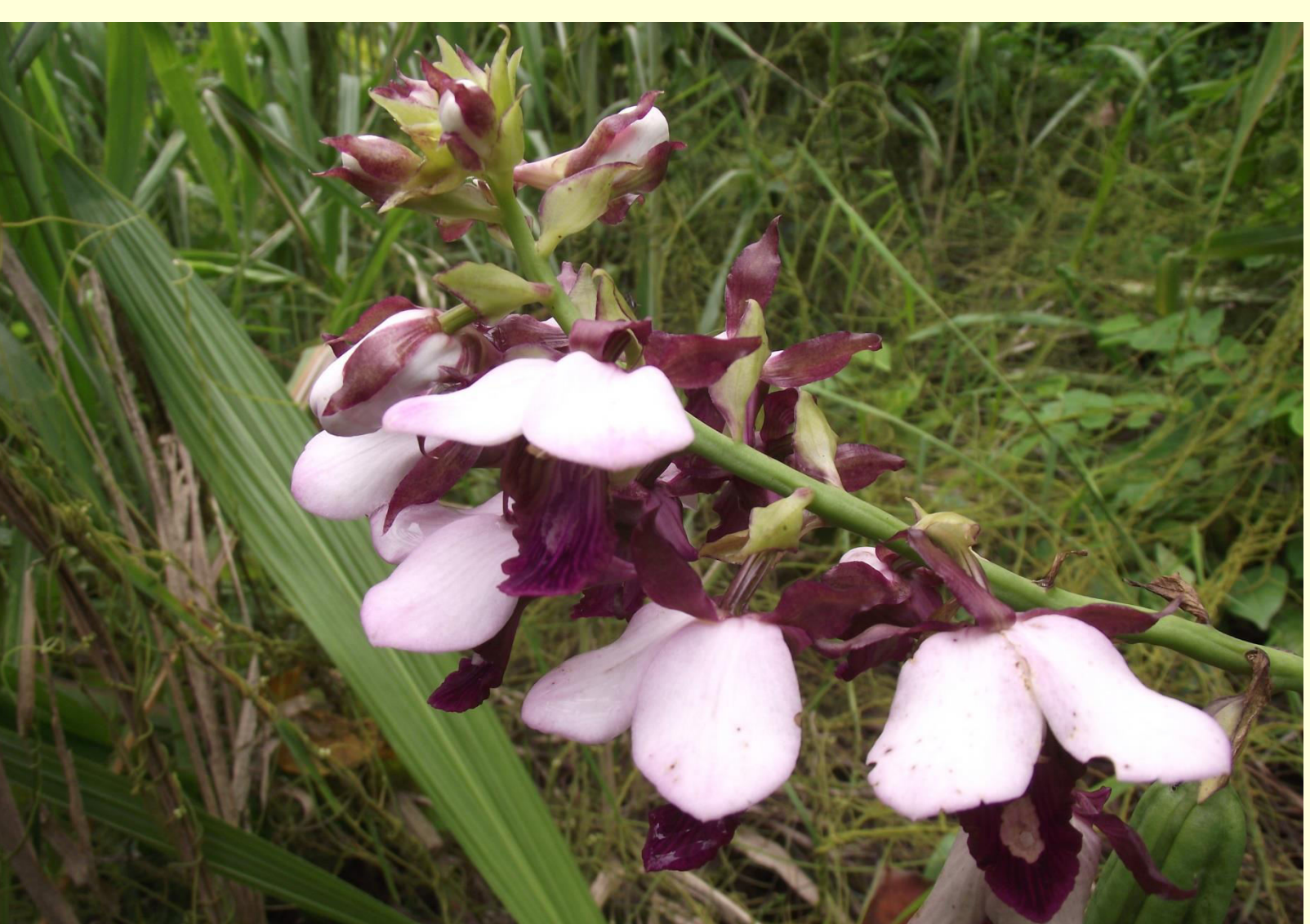
Eulophia horsfallii (Bateman) Summerh.