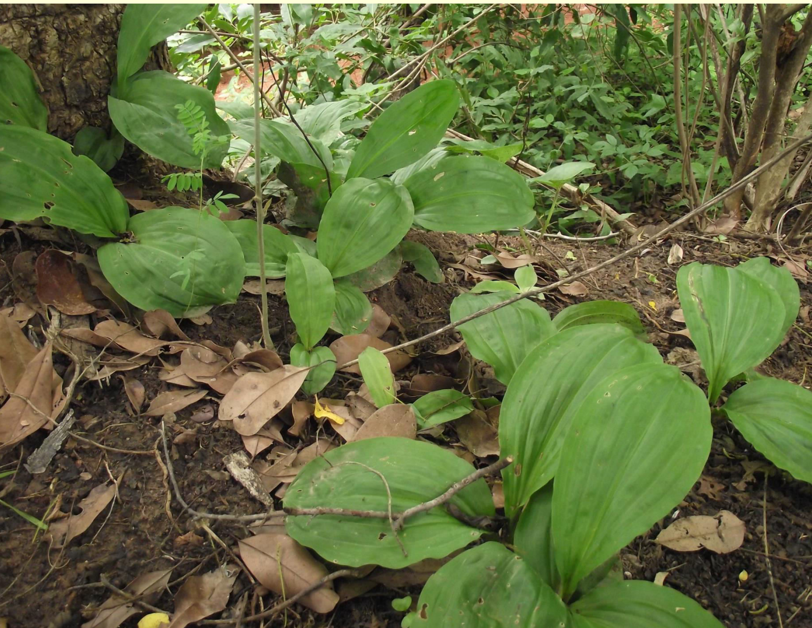
Eulophia guineensis Lindl.