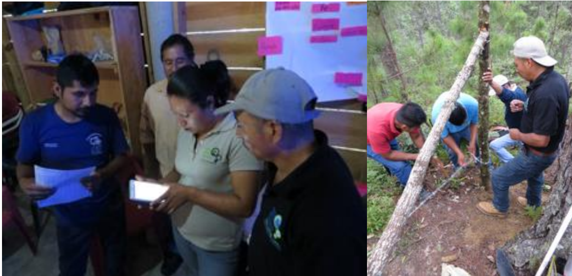
Left: Training on the use of cybertracker. Right: Community members setting exclusion parcels to understand the impact of livestock and deer on forest regeneration

During August 2015, a fourth workshop took place in the community of San Juan Lachao. Community members were trained in the use of cybertracker to facilitate data gathering and analysis. Moreover, data was analysed from a number of ecosystem services and climate factors and a monitoring plan was defined to understand if livestock and deer influence forest regeneration in the forest management areas. Six parcels will be set to understand this relationship.