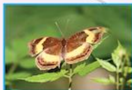
Soldier pansy butterfly

The small remnant evergreen upland forest of City Park is home to troops of Sykes's Monkeys, Silvery-cheeked Hornbills and hundreds of beautiful butterflies. This forest is a precious natural resource for the people of Nairobi, currently protected in City Park.