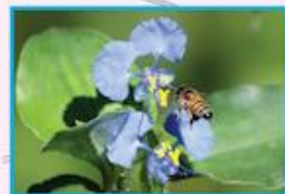
Bee visiting Commelina flower