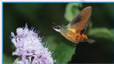
Hawkmoth visiting a Vernonia flower