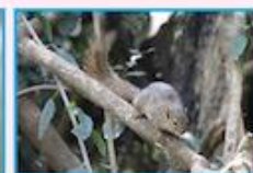
Ochre bush squirrel