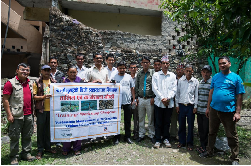
Training/Workshop in Drachula District, Nepal.