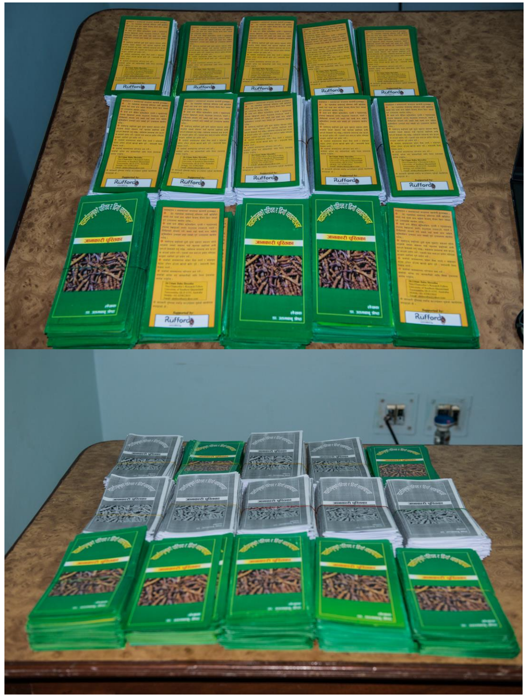
Logo of Rufford Foundation in brochure.

Yes, I used logo of Rufford foundation in banner, brochure and acknowledgement slide of my presentation as well as in the published articles. Rufford foundation is also mentioned in the article published in Nepal Magazine.