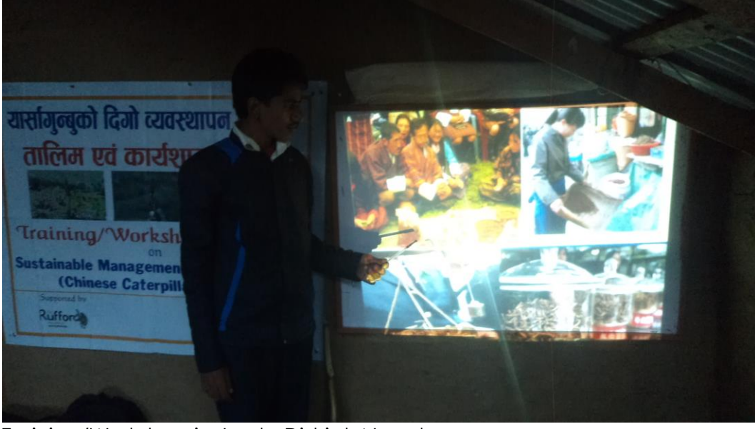
Training/Workshop in Jumla District, Nepal