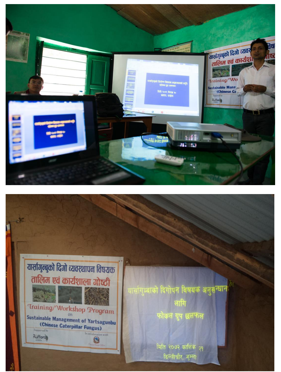
Logo of Rufford Foundation in Poster.