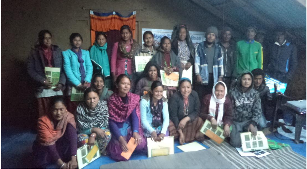
Training/Workshop in Jumla District, Nepal