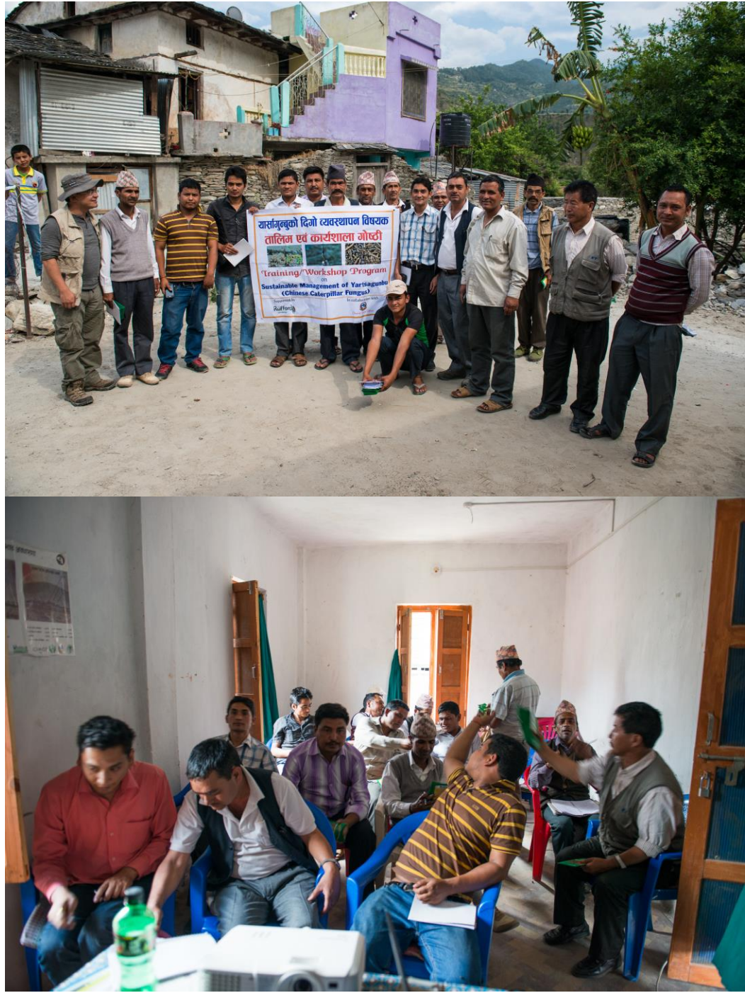
Training/Workshop in Bajhang District. Nepal