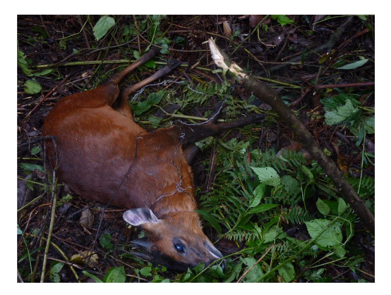
Figure 2. A duiker caught in snare