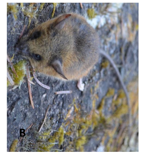
Figure 1. A. Ochotona macrotis B. Niviventer eha

The data analysis using statistical test showed small mammals were influenced by different environmental factors like slope, aspect and elevation. The highest number of animal was recorded on gentle slope 84 % (n=109) and overall number of small mammals was recorded maximum in northeast, southeast and south aspects with total number of 50, 27 and 17 respectively.