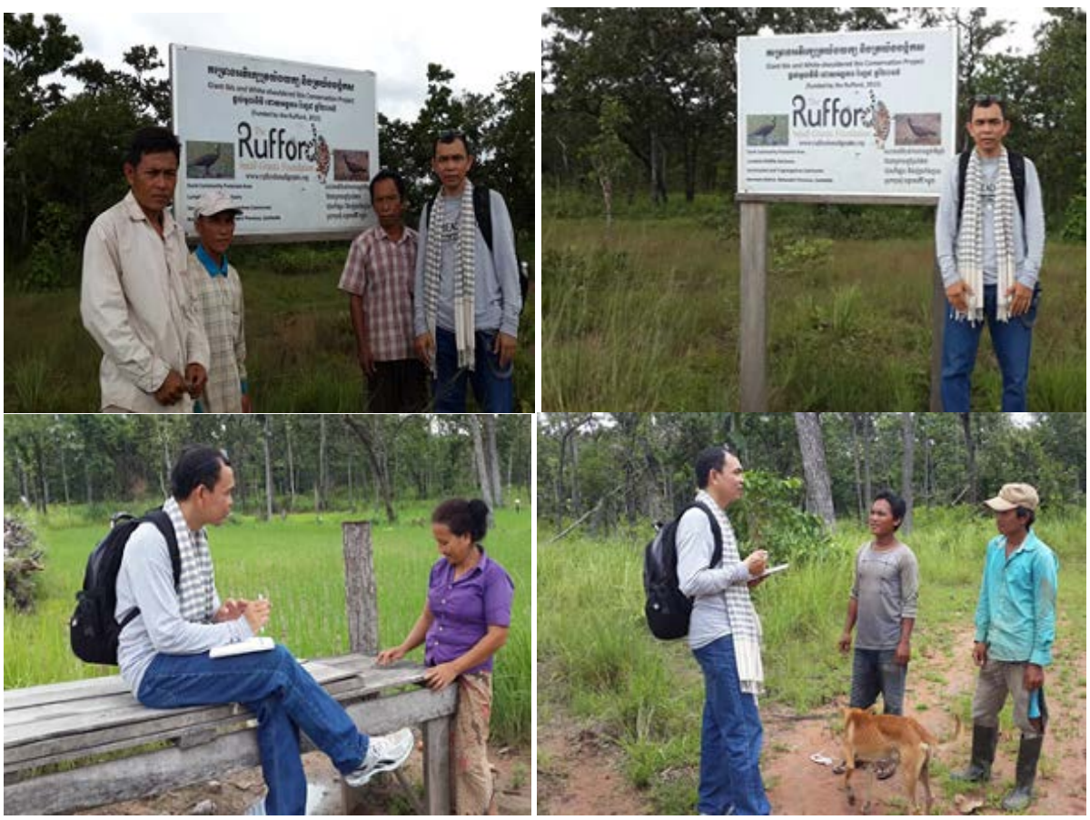
Top: With community committee members stand by Rufford project logo in their community forests; Left: Interview with community member about Giant ibis and White shouldered ibis information in her community forests. Right: Interview with community member about Giant ibis and White shouldered ibis information in her community forests.

The project site is in Ourei Community Protected Area, Sereimonkol and Trapeangchres Communes, Lumphat Wildlife Sanctuary. It located in Rattanakiri province, one of the Cambodian's most remote and, approximately 600 km northeast of Phnom Penh. Every month, we go to participate with patrolling team to monitor illegal logging, community land forest clearing, wildlife hunting and also to transect walking to observe regularly habitats of the giant ibis and white shouldered ibis. On the other hand, during that time we interviewed with community members and villagers to know information about giant ibis and white shouldered ibis in their community forest and in cropping rice field and about their interested in giant ibis and white shouldered ibis protection and conservation.