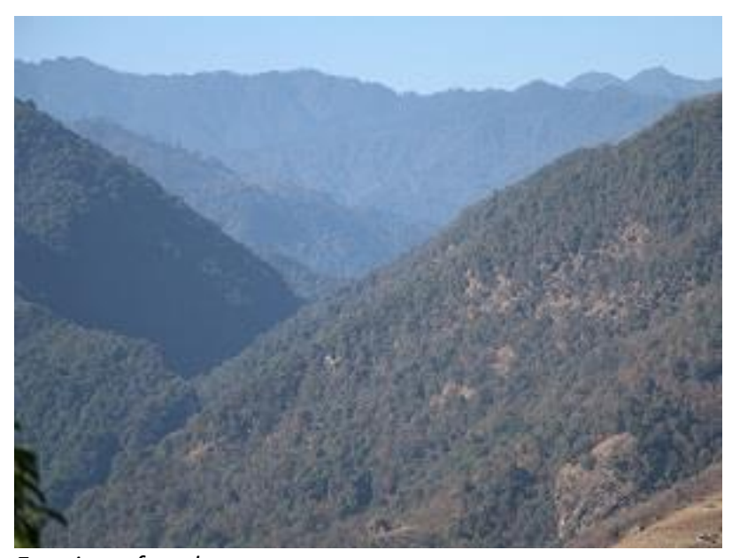
Eye view of study area

The project on assessment of Nika Chhu freshwater ecology in the Jigme Singye Wangchuck National Park using fish diversity and habitat as a bio-indicator is being carried out in the Tangsibji hamlet, Trongsa district and Sephu hamlet, Wangdi Phodrang district (Map 1). The survey will cover a stretch of Nika Chhu between the coordinates of N: 27°28′21.463 E: 90°21′00.725 (Chendebji Chorten) and N: 27°25′59.756 E: 90°27′49.172 (confluence with main river).