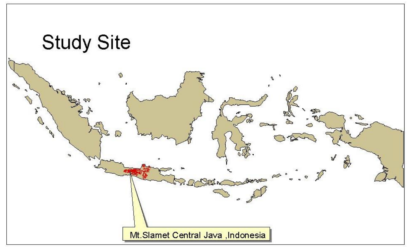
Figure 1. Mt. Slamet in Central Java, Indonesia