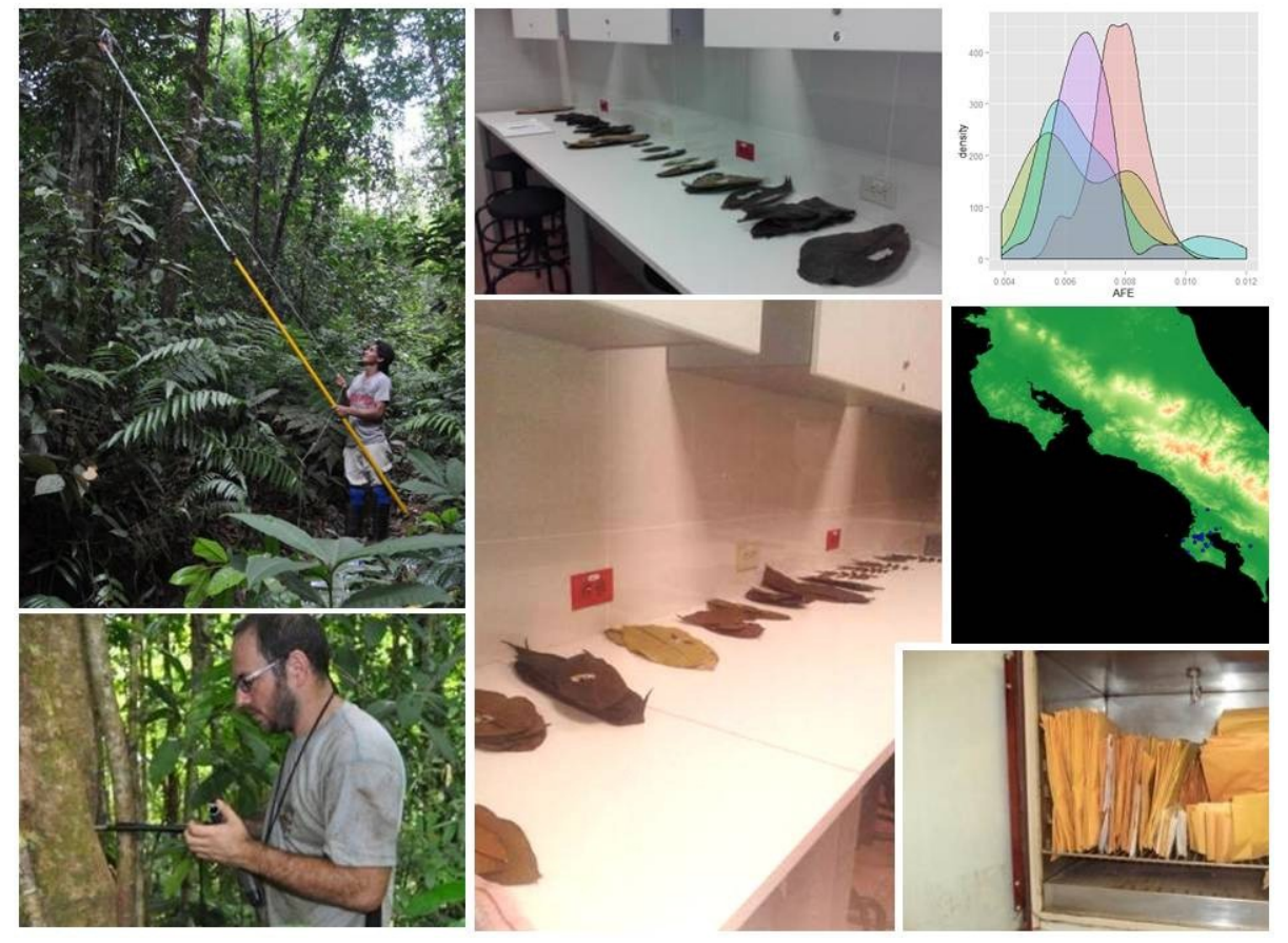
Fig. 2. Collecting samples in the field and measuring and drying leaves in the laboratory. Some images produced with analysis of data.