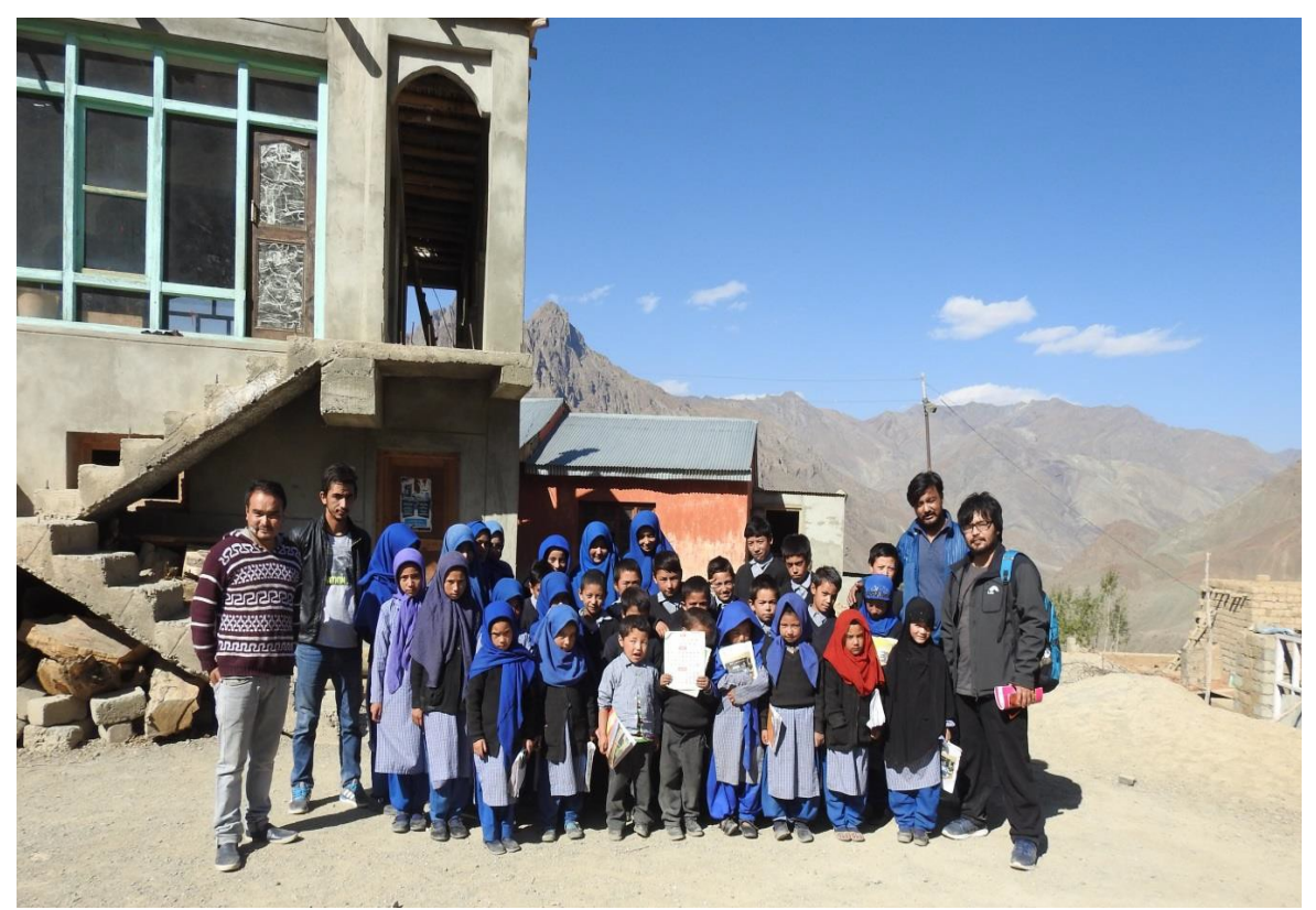
IMAGE D) School outreach Program, aimed at educating students about wildlife conservation and basic knowledge on importance of wildlife.