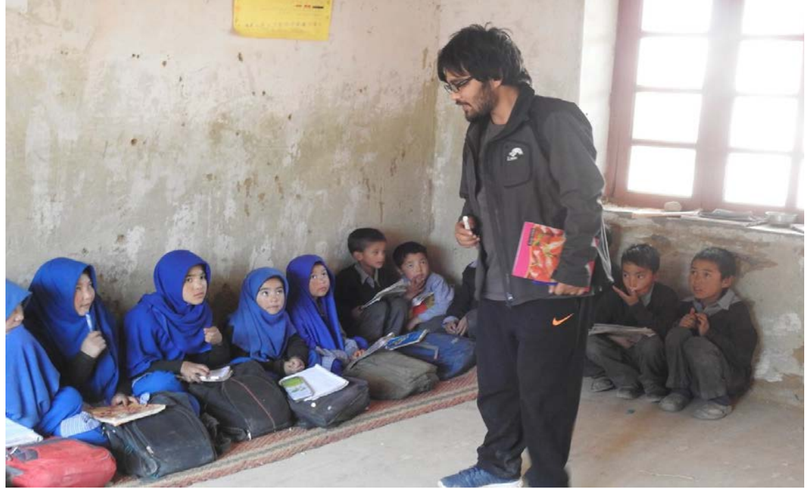
IMAGE D) School outreach Program, aimed at educating students about wildlife conservation and basic knowledge on importance of wildlife.