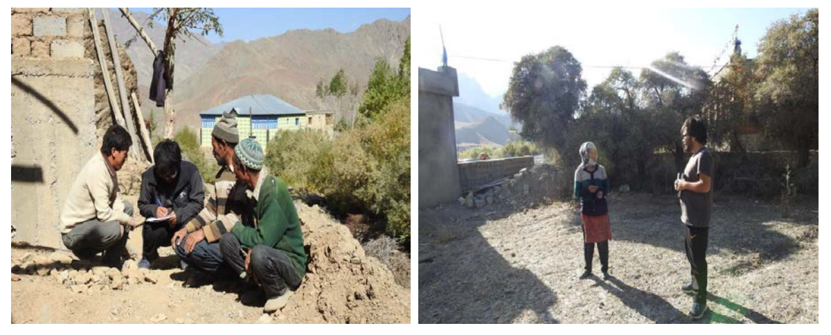
IMAGE B) During Conflict surveys and discussing the major problems and losses faced by the local people by Wild Carnivores.