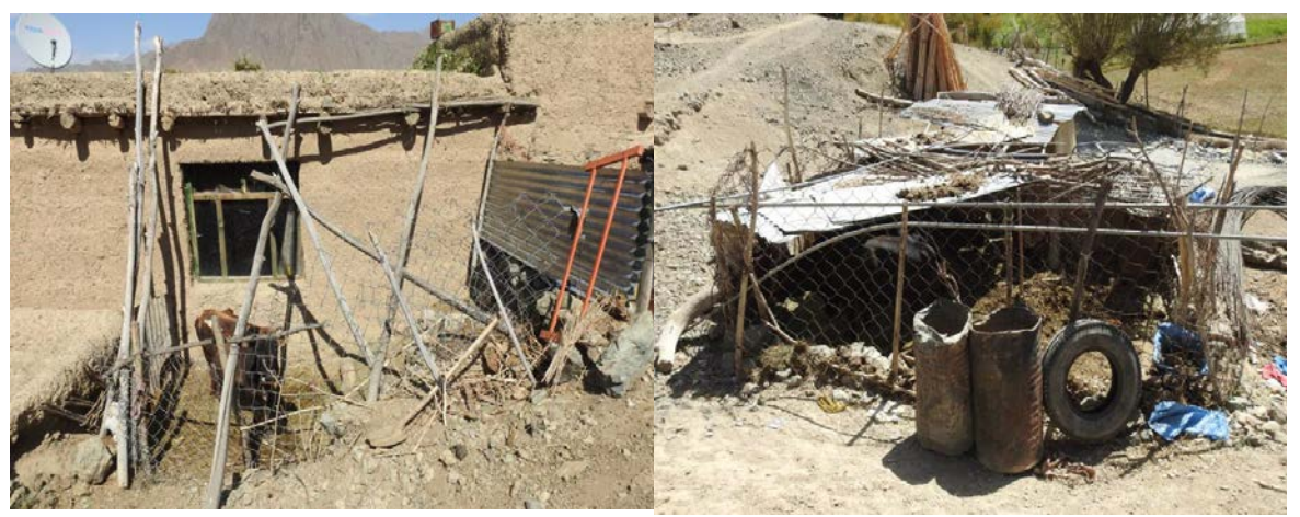
IMAGE C) Local cattle sheds in Kargil. Open and less protected sheds are the main reason for easy entry and escape for large carnivores.