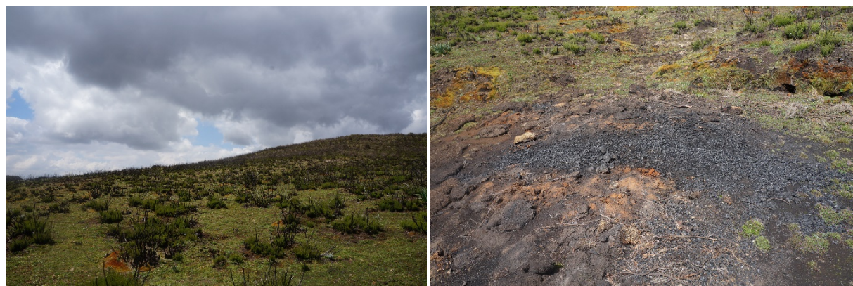
Figure 2: Burnt erica habitat in Galama Figure 3: Burnt erica habitat in Kakka Mountain. Mountain

Uncontrolled burning in the study area is a common occurrence. It has had a number of negative impacts on the local environment including degradation of the Afroalpine vegetation. The situation is now severe and degrading the fully grown erica vegetation which provides important cover for mountain nyala. Wildlife conservation awareness program should be launched with other stakeholders so as to get the support of the local community. The sustainability of conservation areas depends on the full hearted support of the local community that also helps for the sustainable utilization of the wildlife resource. As a result, local communities and administrators will be aware of the ecological importance of Afroalpine and Erica habitats and will participate in conservation of mountain nyala in the area.