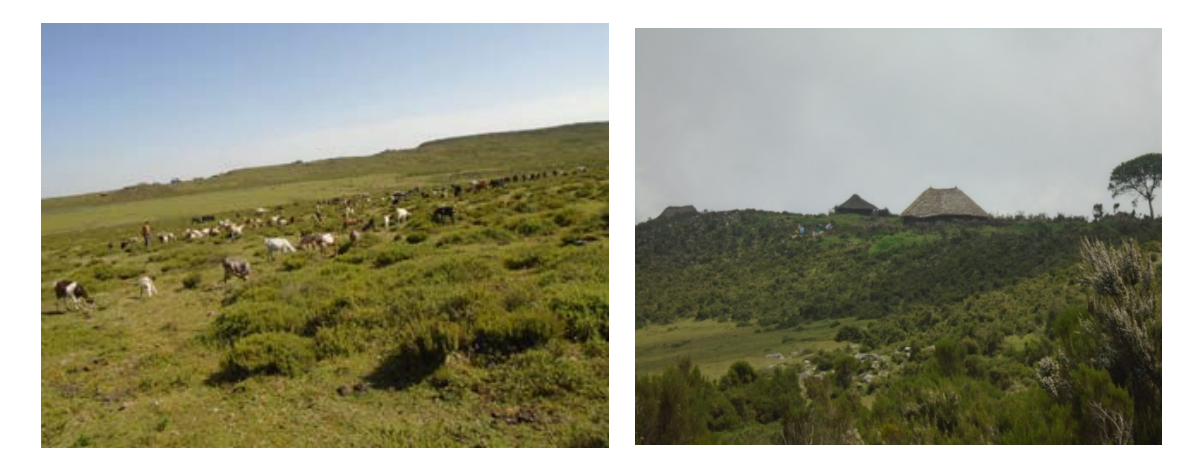
Figure 4: Livestock grzing in Arbagugu Figure 5: Human encroachemnt in Arbagugu Controlled hunting area

Livestock grazing is widely spread as an increasing conservation challenge in Arsi and Ahmar Mountains. "Godantu" (traditional livestock keepers) are severely affecting the Arsi Mountains National Park and CHAs. The CHAs are potential sites to practice sustainable utilization of the wildlife resources, but livestock grazing and human encroachment has become increasing in recent years and the natural forest is under severe pressure from illegal logging. Hence, the local administrative bodies, concessionaire and other stake holders should work best to mitigate the encroachment activities and agricultural expansion in the area.