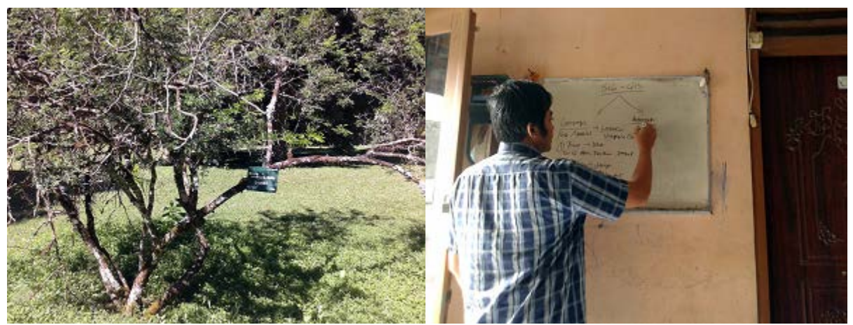
Left: Acacia nilotica. Right: GIS study

We also went to Ministry of Forestry central office in Jakarta to arrange for permits to enter the national park and to conduct the fieldworks.