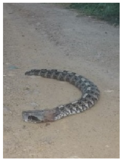
Snake killed using snare