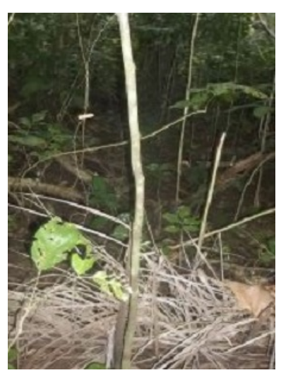
Sample of snare found in the Squirrel caught using snare forest