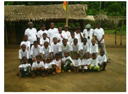
Group photo with pupils and teachers after conservation education programme activities, in front of a classroom