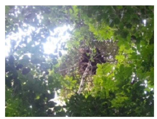
Great apes nest found