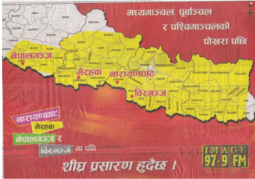
Coverage of Image FM 97.9

On 9 March 2007, agreement with Image FM 97.9 for their air time. We have agreed to air the programme from 7:30 am to 8:00 am (half an hour) every Saturday effective from 10 March 2007.