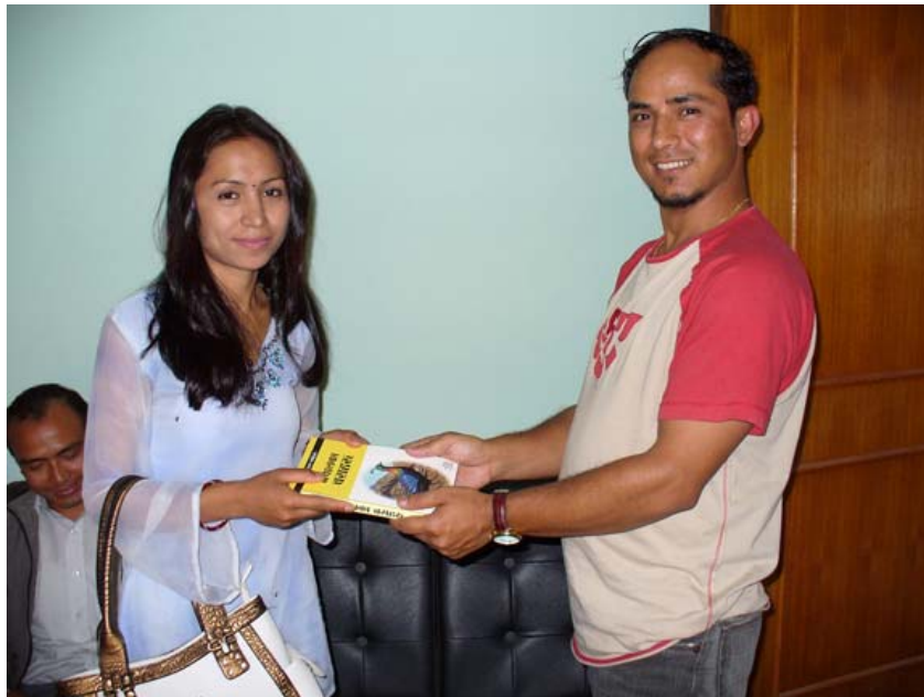
Winner of the quiz context receiving prize

Respondents from Kathmandu Valley and Outside Kathmandu Valley