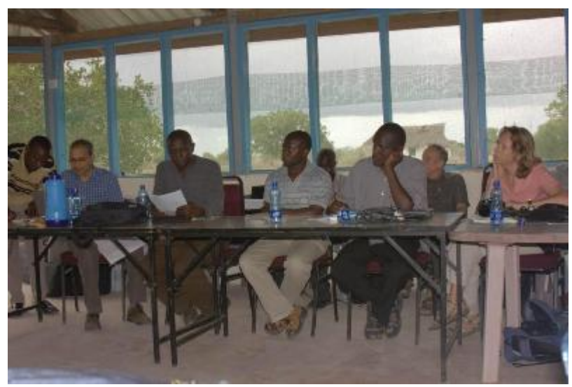
Plate J: Stakeholders attending hirola workshop in June 2011, held at Ijara, Kenya

result of my sustained campaigns. There are plans to revive the Arawale National Reserve and create several community conservancies within the hirola range.