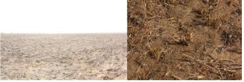
Plate C: Ploughed land in the seasonal flood plains Plate D: Overgrazed habitat patch in Ishaqbini

Hirola were found to prefer habitats in open grassland with scattered small shrubs and trees on well-drained sandy soils (Plate E). Hirola are often found in the company of other animals such as gerenuk ( Litocranius walleri ), Grant's gazelle ( Gazella granti ), plains zebra ( Equus burchellii ), and oryx ( Oryx beisa callotis ). They avoid close association with domestic cattle which co-occur in the same range and utilise similar resources, perhaps indicating competition.