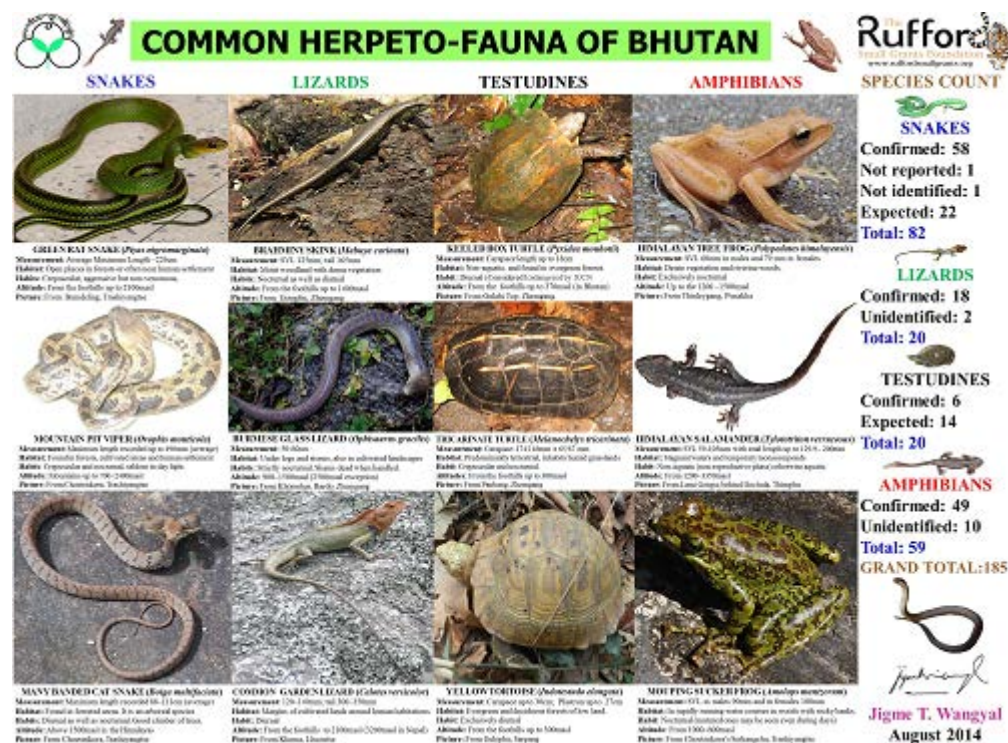
Figure 1: Poster presented at the annual BES seminar, Thimphu.

Yes, on several occasion we used the Rufford Foundation logo. The first time it was used was for the poster presentation competition held by Bhutan Ecological Society an NGO based in Thimphu of which we are members (Figure 1). Publicity of the foundation was also ensured when presentations were made at various institutes like College of Natural Resources, Bhutan, National Park Conference (Figure 2), face book (Figure 3), etc..