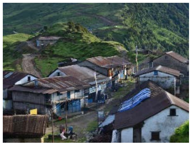
Settlement in Guphapokhari