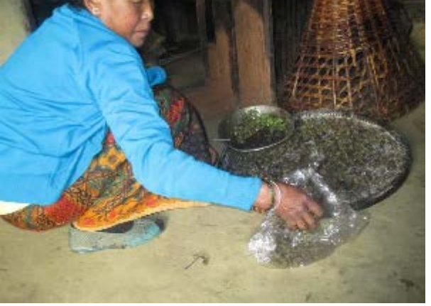
Local woman drying collected medicinal plants