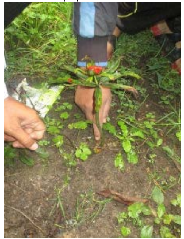
Briefing harvesting method to local people