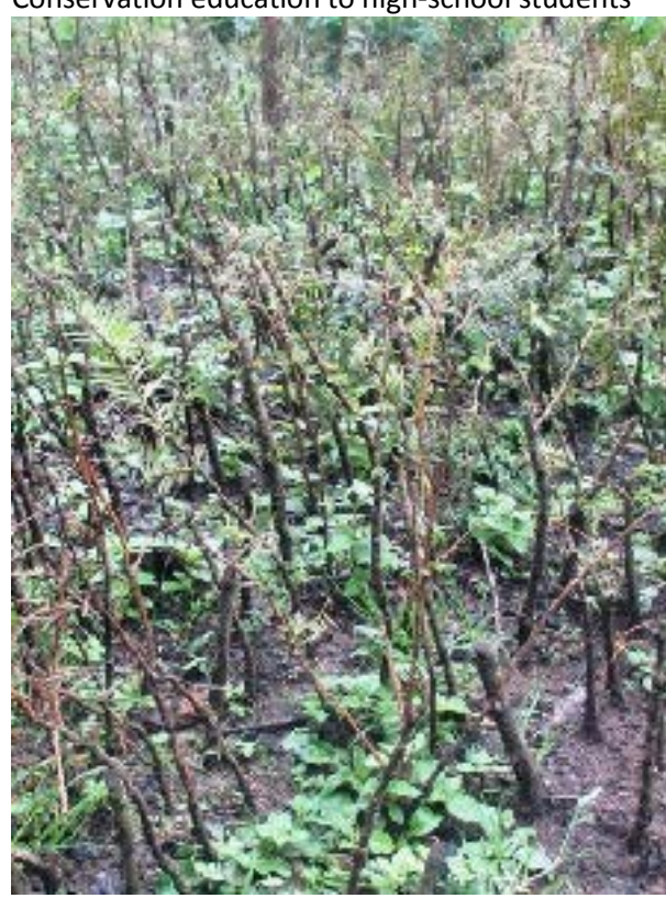
Saplings of Taxus wallichiana