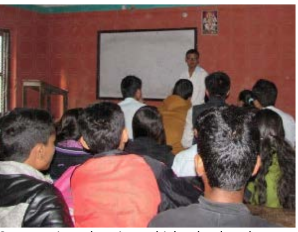
Conservation education to high-school students