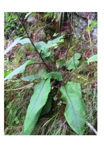
Photo 10. Saussurea kolesnikovii is rare endemic species growing only in the northern part of Terneysky District in Primorskiy Kray of Russia.