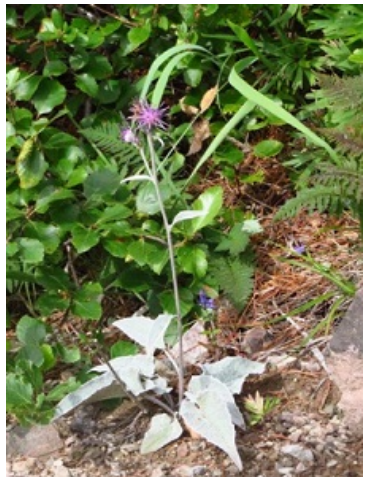
Photo 7. Collecting Saussurea vyschinii on the Tuman Mountain. Photographer is Svetlana Bondarchuk