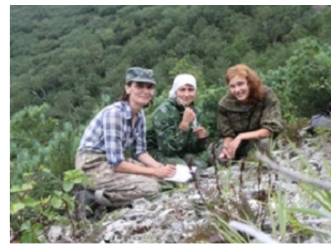
Photo 8. Describing of Saussurea vyschinii population.