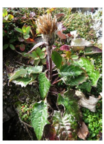
Photo13. Saussurea nakaiana is endemic species of Sikhote-Alin Mountain Range in Far East of Russia.