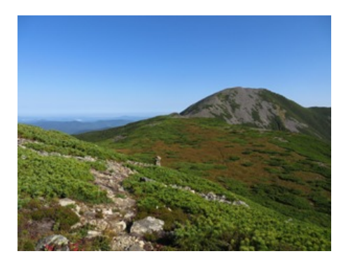
Photo 11. Oblachnaya Mountain (1855 m) is the habitat of endemic species Saussurea nakaiana .