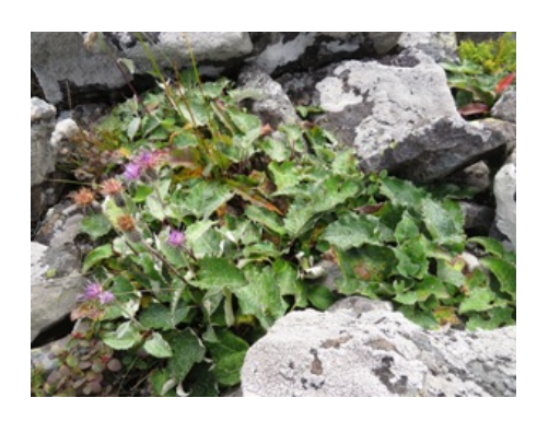
Photo 12. The part of Saussurea nakaiana population. Photographer is Elena Pimenova

Photo13. Saussurea nakaiana is endemic species of Sikhote-Alin Mountain Range in Far East of Russia. Photographer is Elena Pimenova