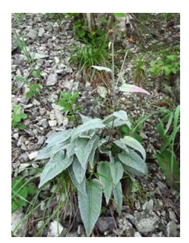
Photo 5. Saussurea vyschinii is endemic species. New population of this species was described on the Tuman Mountain.