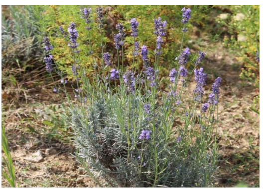
Cultivated rose scented geranium in Doda