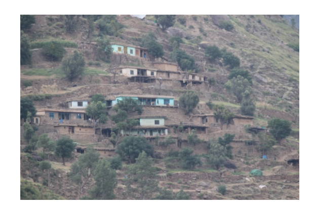
Villages on the hilly slope of Kishtwar