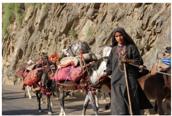
Migration of nomads form high elevations