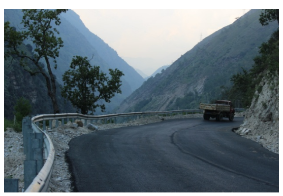
Approach road to Kishtwar district