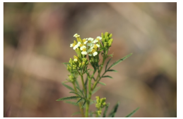
Tegetus minuta in Kishtwar