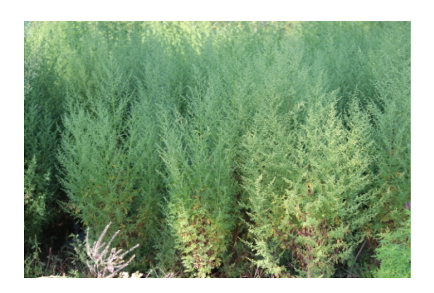
Cultivated Artemisia annua in Doda