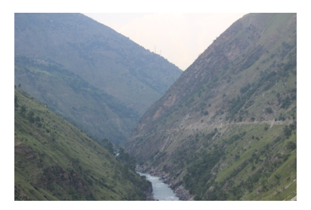
Hilly terrain to reach the Kishtwar district (Chenab river in gorge )