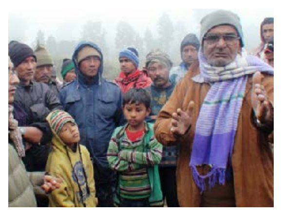
Figure 1: A training session on human-elephant coexistence in Nirmalbasti-4, Bramhanagar, Nayabasti, Parsa.

The training covered different aspects of elephant conservation, elephant behaviour and ecology, causes of conflict, avoiding conflict with elephants, government relief mechanism and initiatives of BZUC to minimise conflict. Following table gives details of the training events.