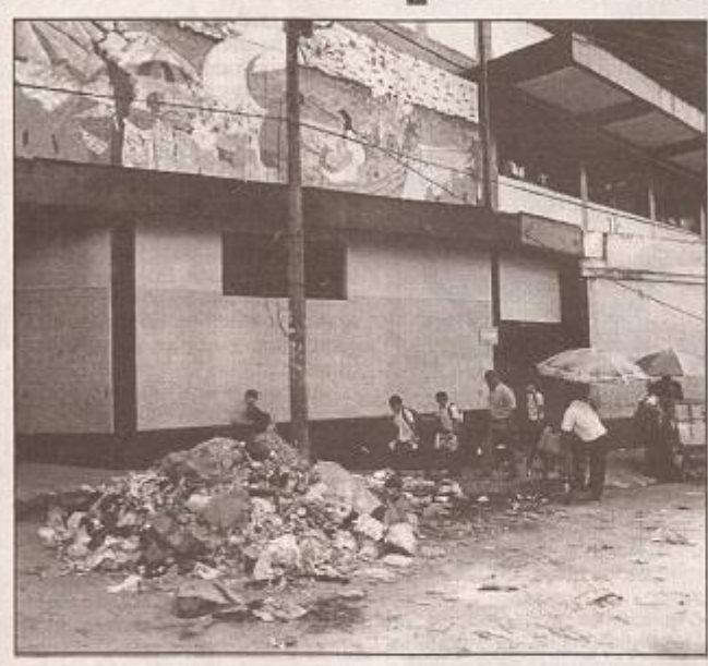
Cúmulos de basura se puede encontrar tanto en Belén como en toda la ciudad.

fines de lucro para la conservación del medio ambiente y rio, tiene como proyecto la programación de charlas educativas en diferentes colegios de