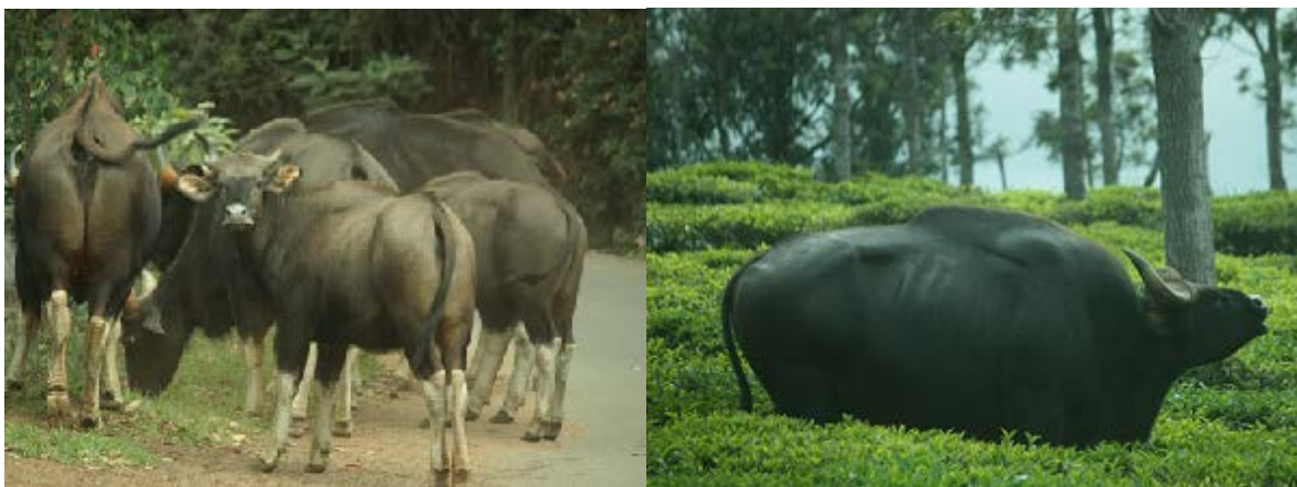
Left: A herd crossing club road at 4pm. Right: A male trying to find the female (A low pitched moo!)

Outreach is currently planned through Gaur Awareness Programmes to be conducted in educational institutions across Kotagiri. A gaur awareness kit is also being compiled with assistance from the Zoo Outreach Organisation to spread awareness to a varied audience. Discussions are being held with the Wildlife Trust of India on putting up signage at crucial gaur crossing points within the town of Kotagiri. The signage will be put up in consultation with relevant state departments.