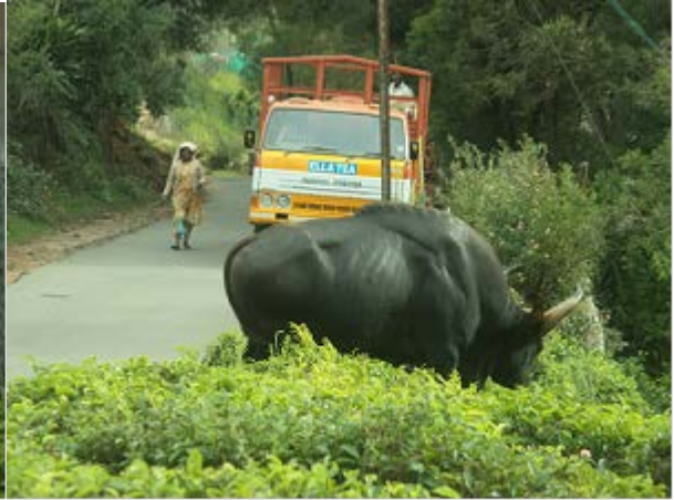
Left: A woman who works at a Greenhouse is ready with her Gaur deterrents. (A stick and a steel glass when hit against the fence can be very disturbing.) Right: An Old Bull moving away from the people and into the Kannerimukh Valley.