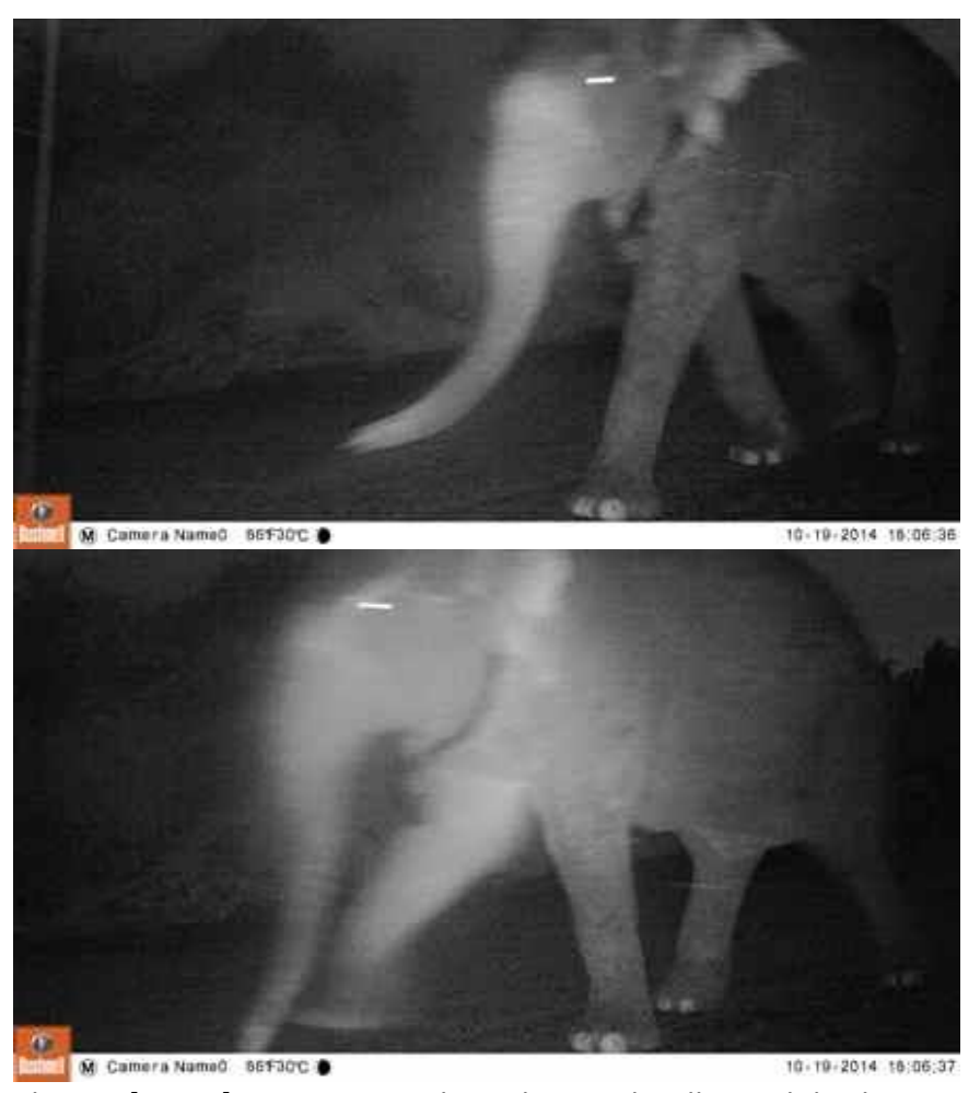
Plate 4: [M155] was going to the Dahaiyagala village while charging at the guards.

It would be hard to chase the crop raiding elephants back to the park at least without those minimal facilities. In the meantime, the crop raiding elephants - such as [m155] - entered Dahaiyagala village (plate 4), charging even at the guards who were on duty in the dark guard rooms.