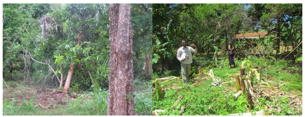
Plate 2: Uprooted Coconut and Mango trees and some destroyed Banana trees in two home gardens