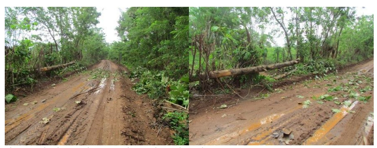
Plate 1: A broken Teak tree on the road at Pokunuthanna

It was raining heavily during this month's field work and the muddy roads in the villages made travelling very difficult. A road was blocked in Pokunuthanna village by a fallen tree which was done by elephants (plate 1).