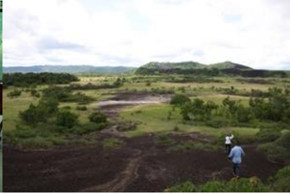
Left: Collecting general data with Refugion Nimajay PONR Owners. Right: Field trip in Ventanas PONR to verify GIS points.