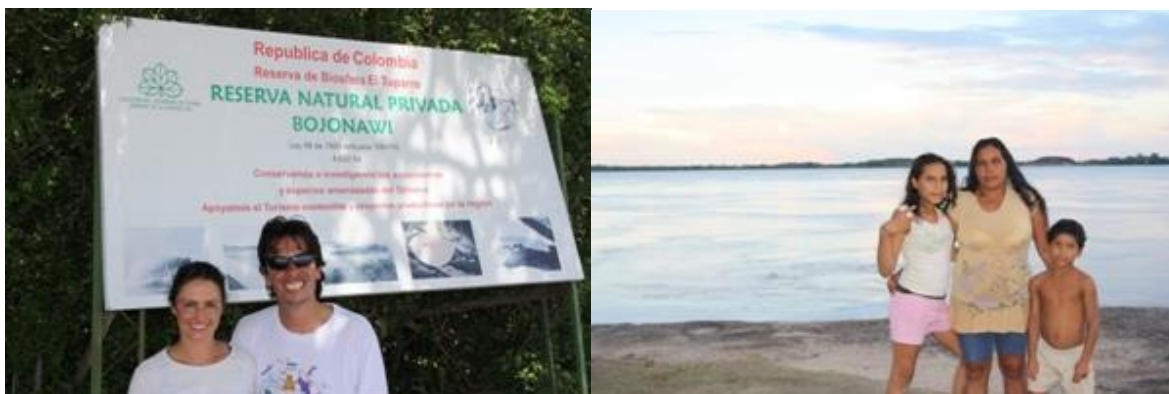
Left: Working with the regional coordinator of Bojonawi . PONR located in Orinoco River. Right: Local stakeholders of Bojonawi PONR.

In the next months we will start field trips to acquire GIS data for some PONRs and continue with data analysis. Also I will set up the ornithology workshop for the local stakeholders.